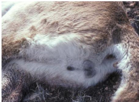
Male mountain lion hindquarters