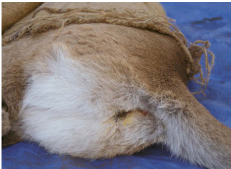
Female mountain lion hindquarters

Tracks also can be good indicators of sex. Adult and large, sub-adult males usually have hind foot plantar (heel) pads more than 2 inches (51 mm) wide. Adult and sub-adult female lions usually have heel pads less than 2 inches wide. Hunters should carry a small ruler or wind-up metal tape to measure tracks.