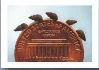
New Zealand mudsnail