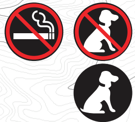
On Designated Trails

No bikes or equestrian users past this point.