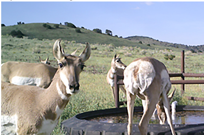
Pronghorn drink water from an HPP tire tank.

HPP is designed to work on private and public property; anywhere there is a problem or a solution.