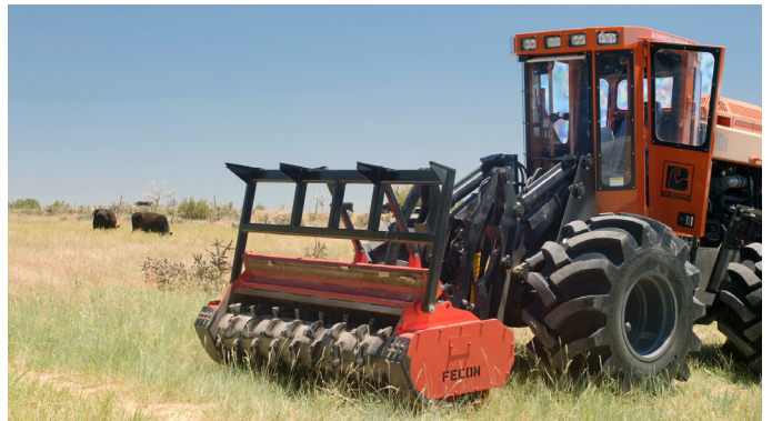
Fecon head used for tree and shrub cutting.

Working with a local land trust, HPP can pay some transaction costs to help a willing landowner establish a conservation easement on their property. Such costs include appraisals, surveys, baseline plans and legal reviews.