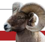
Bighorn ram