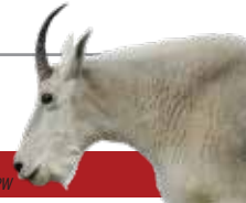
Mountain goat

It's difficult to tell the difference between male and female mountain goats. Refresher tutorial and tips, page 3.