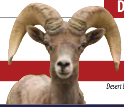
Desert bighorn ram