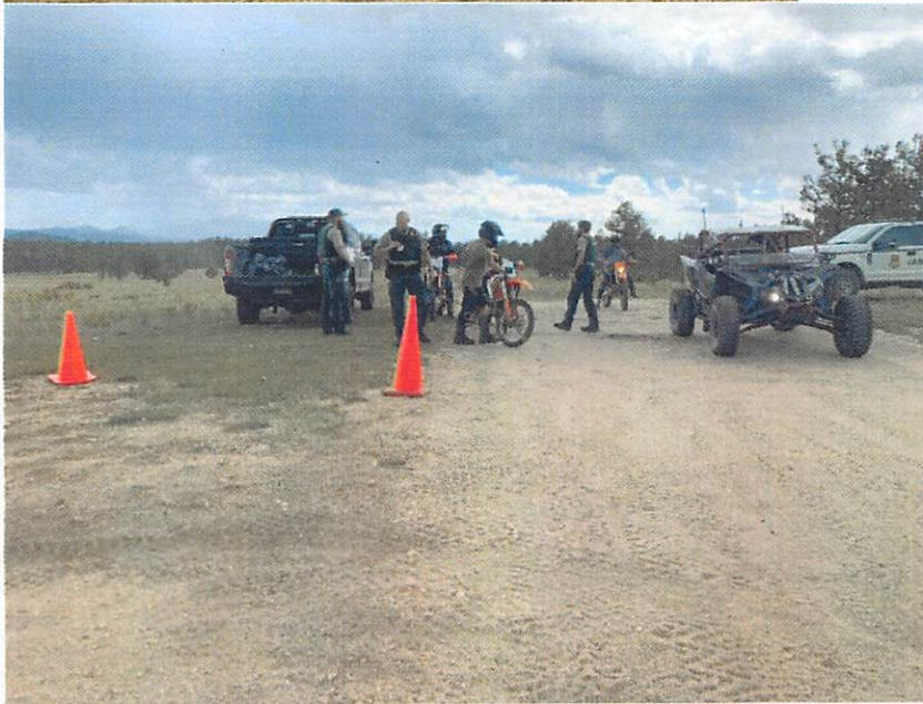
Colorado USFS Law Enforcement Dirt Bike/OHV Crew At the Taylor Park RZR Rally 2022