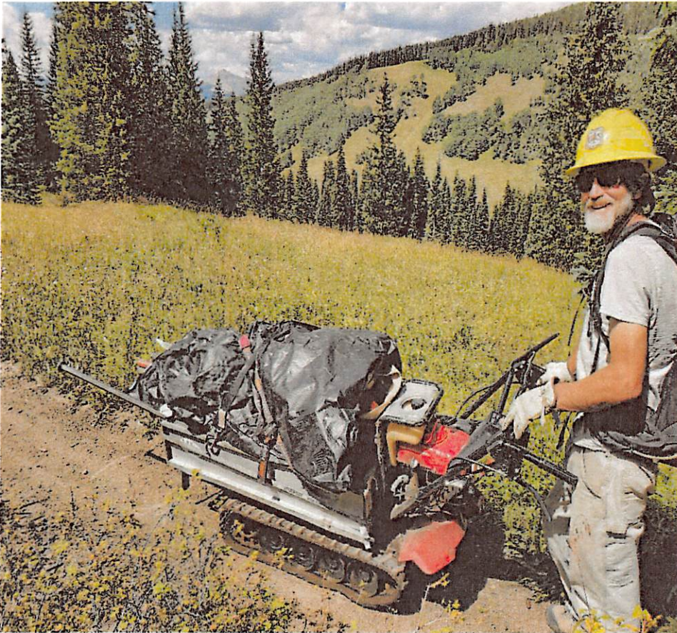
OHV Gunnison Trail Crew