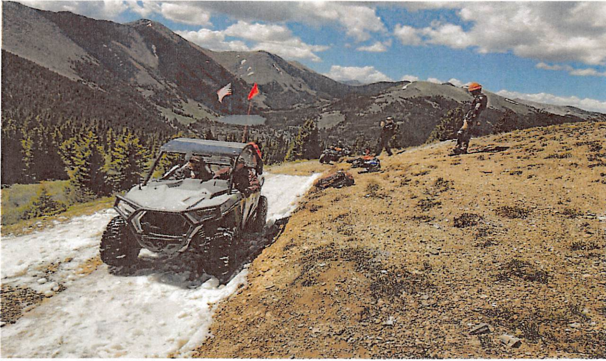
Timberline Trail #414