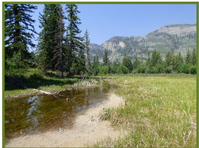
Haviland Lake State Natural Area.

Google Maps link to Haviland Lake campground.