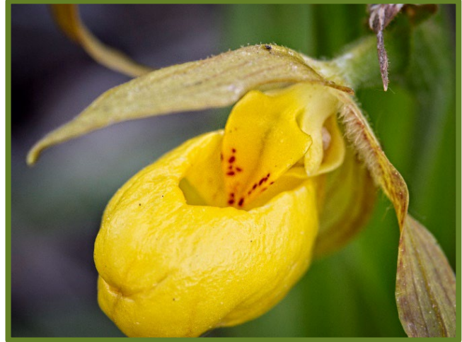
Yellow lady's slipper, a rare plant found at Haviland Lake.

Visitors age 16 and older must have a valid fishing or hunting license, or a SWA pass to access the site. This area is a popular destination for camping and fishing. A U.S. Forest Service campground, restrooms, and drinking water are available on the east side of the lake. Campsites can be reserved on recreation.gov . For up to date information, please visit the Haviland Lake SWA webpage .