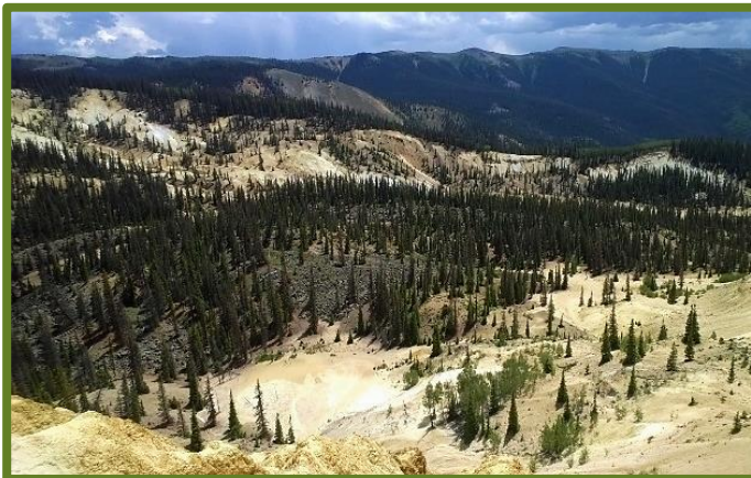
Aerial view down valley from the source of the earthflow