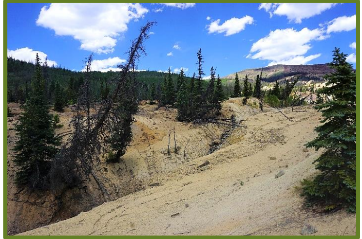
Leaning trees along the active flow

Slumgullion Earthflow Natural Area includes two major earthflows that illustrate a striking example of mass wasting (the movement of large masses of earth material). Slumgullion earthflow is over four miles long and 2,000 ft. wide. This huge mass of volcanic rock slumped down the valley about 700 years ago, damming Lake San Cristobal. This flow is gradually being covered by a younger flow which began 300 years ago. The earth is still moving slowly, evidenced by trees on the older earthflow being pushed over by the forward advance of the younger flow.