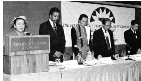
Panelists at the 1991 First National People of Color Environmental Leadership Summit.