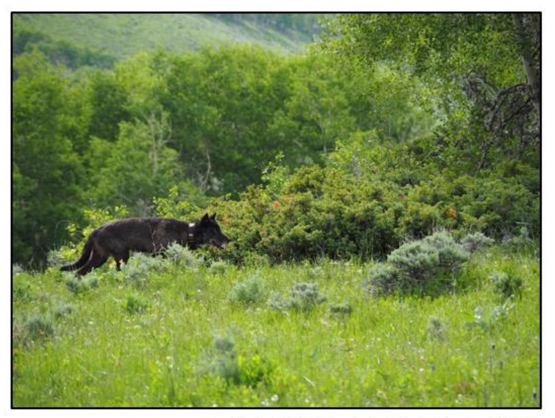
Photo of 1084F taken in North Park, Colorado, July 2019