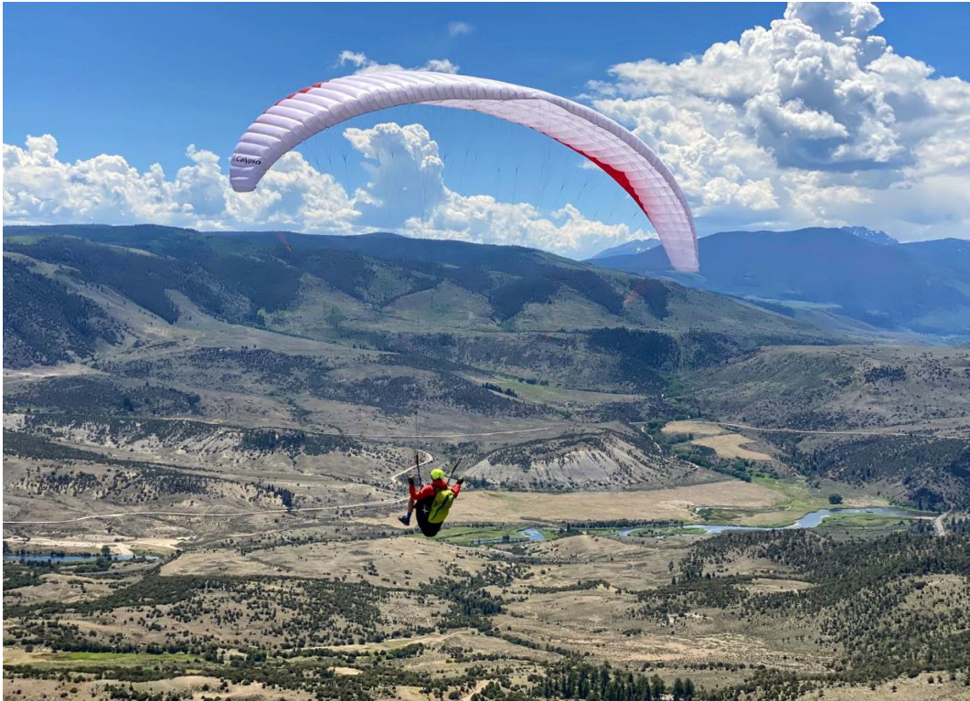
A paraglider launching into the Upper Colorado river valley from Azure.

ISSUE: Allow launching and landing of paragliders within the Radium State Wildlife Area.