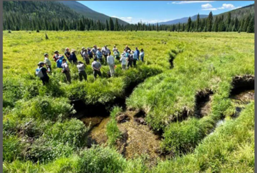
Kawuneeche Valley Ecosystem Restoration