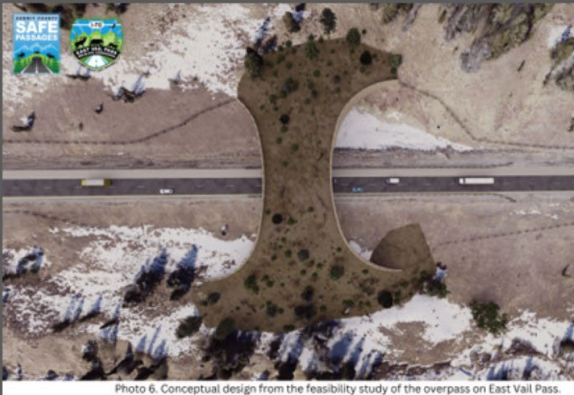
Summit County Safe Passages