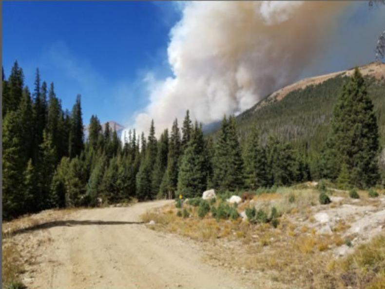
Williams Fork Fire