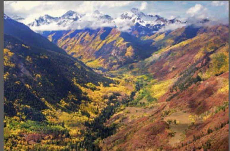
Snowmass Falls Ranch