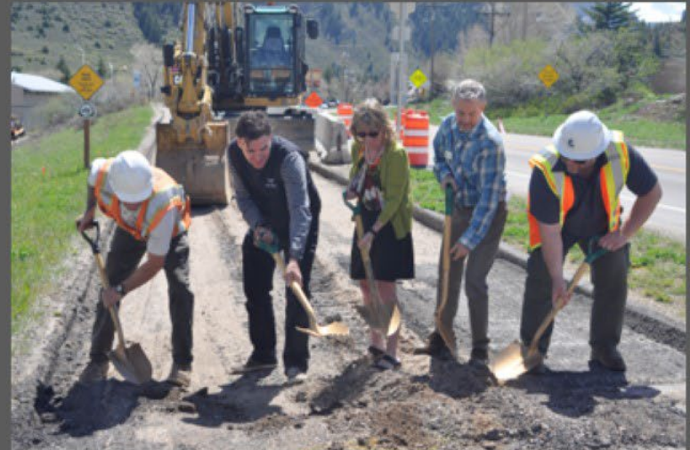
Eagle Valley Trail