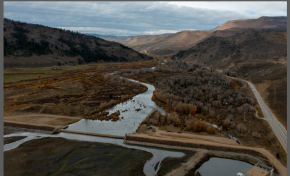
Windy Gap Connectivity Project