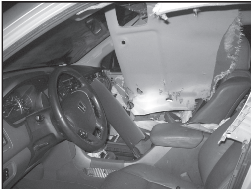
ATTRACTING BEARS TO YOUR VEHICLE CAN RESULT IN THOUSANDS OF DOLLARS IN DAMAGE. ROLL UP YOUR WINDOWS, LOCK YOUR DOORS AND DON'T LEAVE FOOD OR ATTRACTANTS IN YOUR CAR.

If you're driving your car or RV to a remote, undeveloped site in the forest, please read our Camping and Hiking in Bear country brochure. Food and other items with odors should still be stored in bear-resistant containers or hung properly. Keep windows and doors closed and locked at all times. Don't leave anything that a bear might associate with food in view, such as coolers or grocery bags, even if there is no food in them. A bear may recognize them as objects that usually have food and be willing to break into your vehicle in hopes of getting a reward.