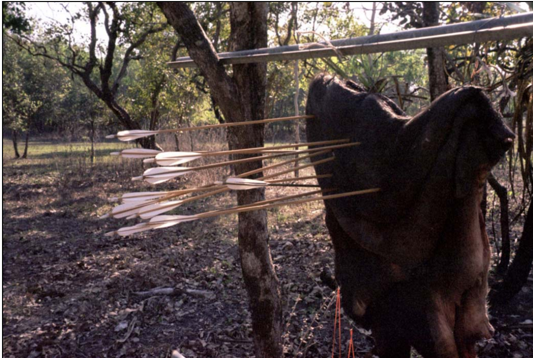
Test shots on buffalo skin. Note penetration of small diameter, double shaft arrow.