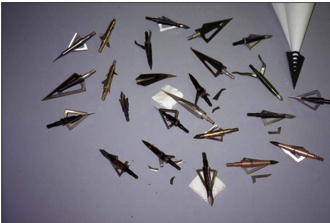
Some of the broadheads damaged during 2004 testing.