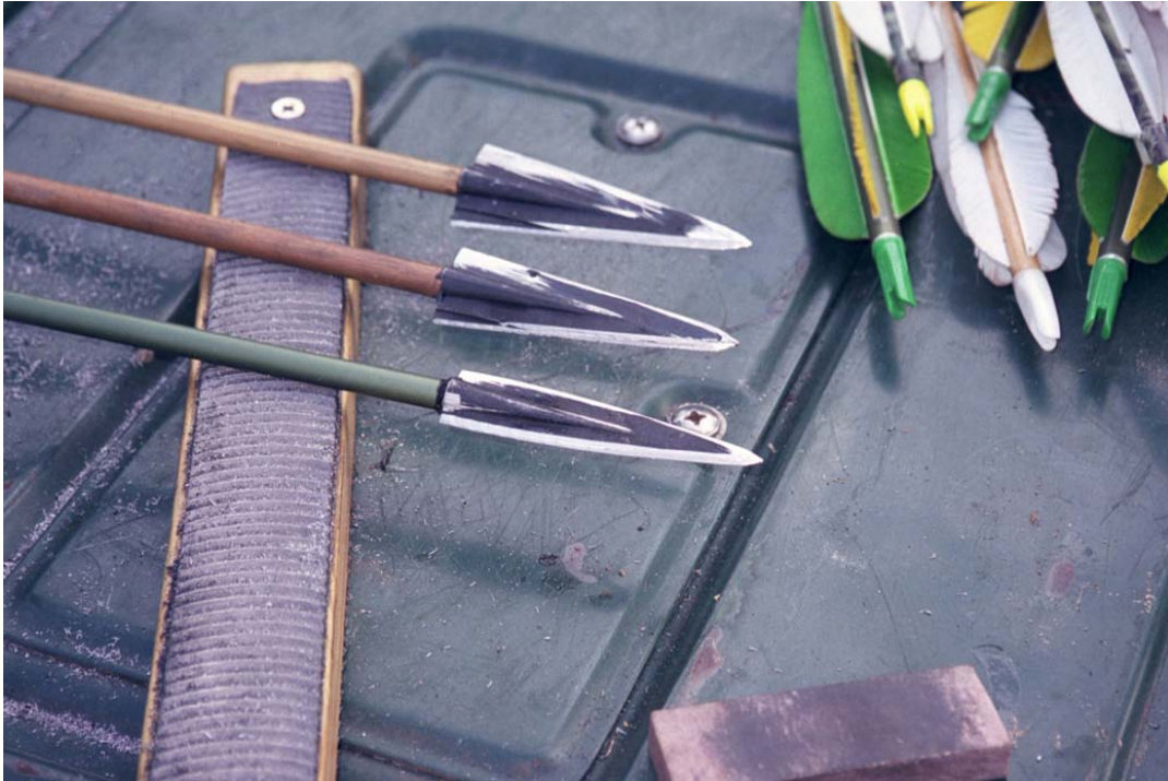
190 grain Grizzly (top); 1" wide modified Grizzly (center); and Grizzly Extreme (bottom).