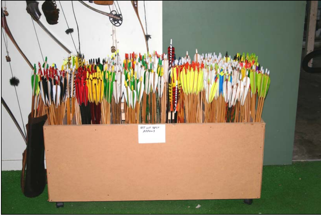
Setup test arrows for the 2004 study.