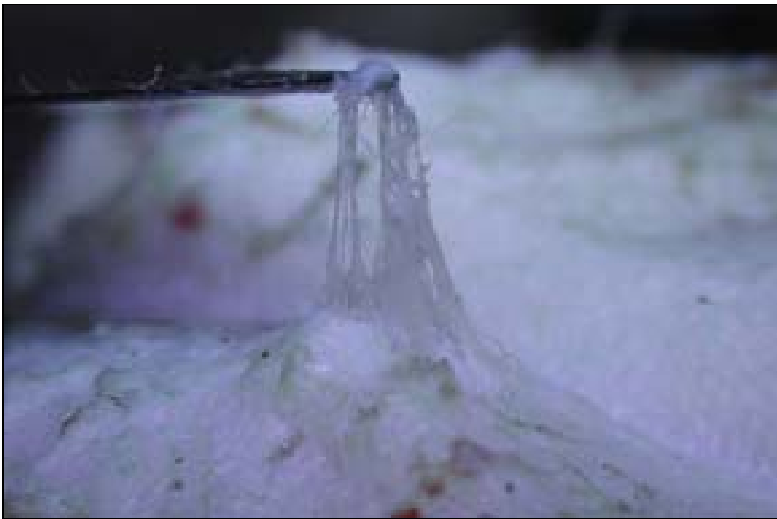
Fibrous texture of Asian Buffalo skin.