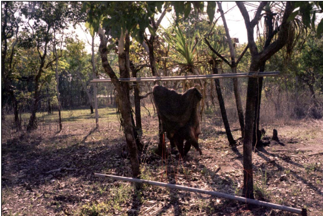
The setup used for the skin penetration test.