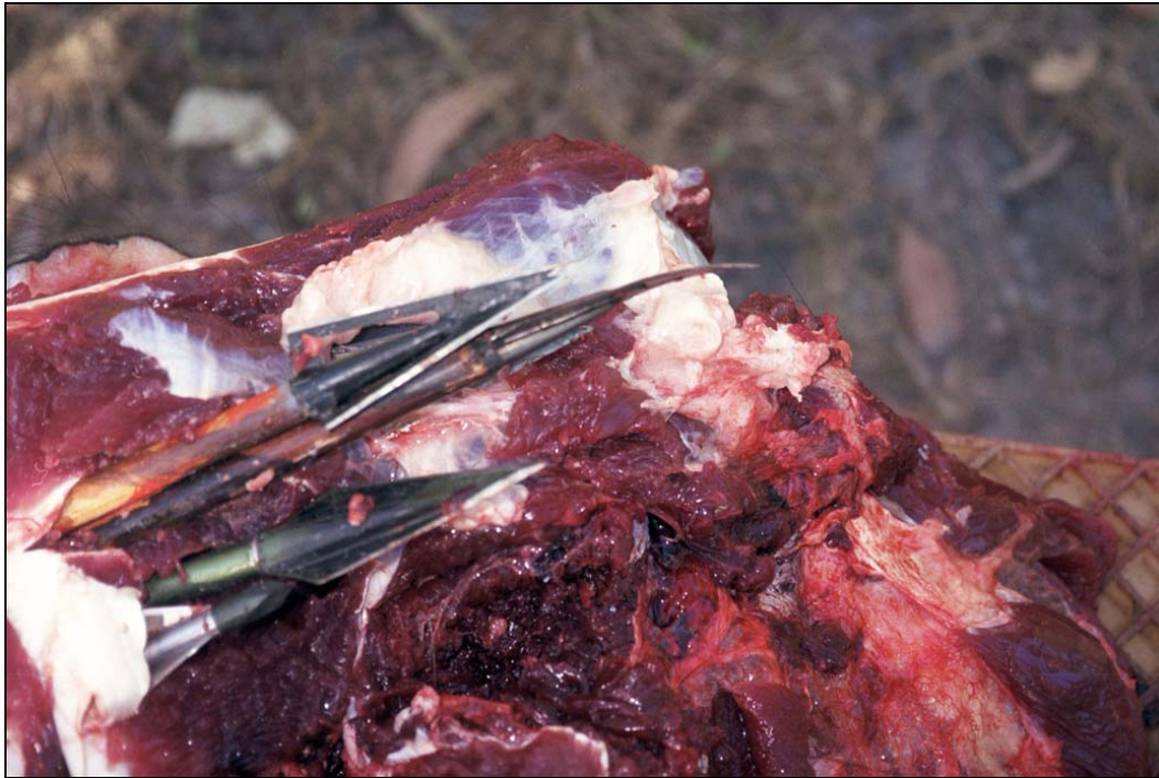
Penetration of these broadhead was halted by entrance ribs.