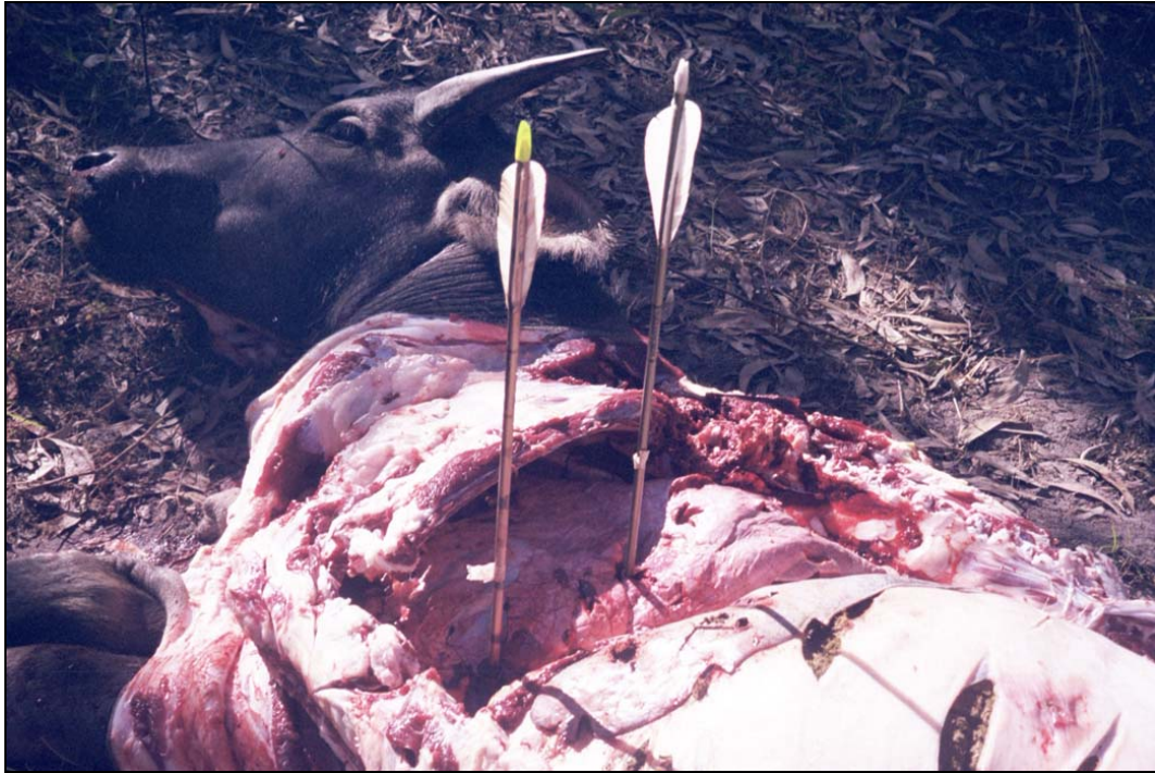
These double shaft arrows, imbedded in off-side ribs, show central lung shot and shot into top of heart.