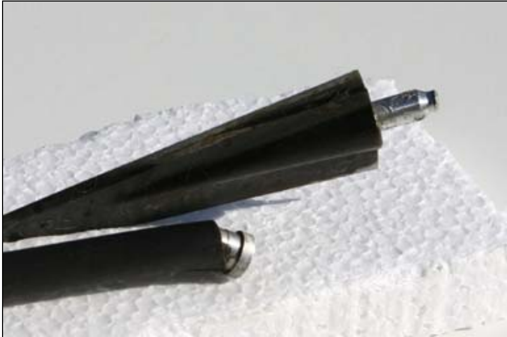
This aluminum adaptor and insert, on heavy double shaft arrow, gave way on right angle impact, fracturing the shaft.