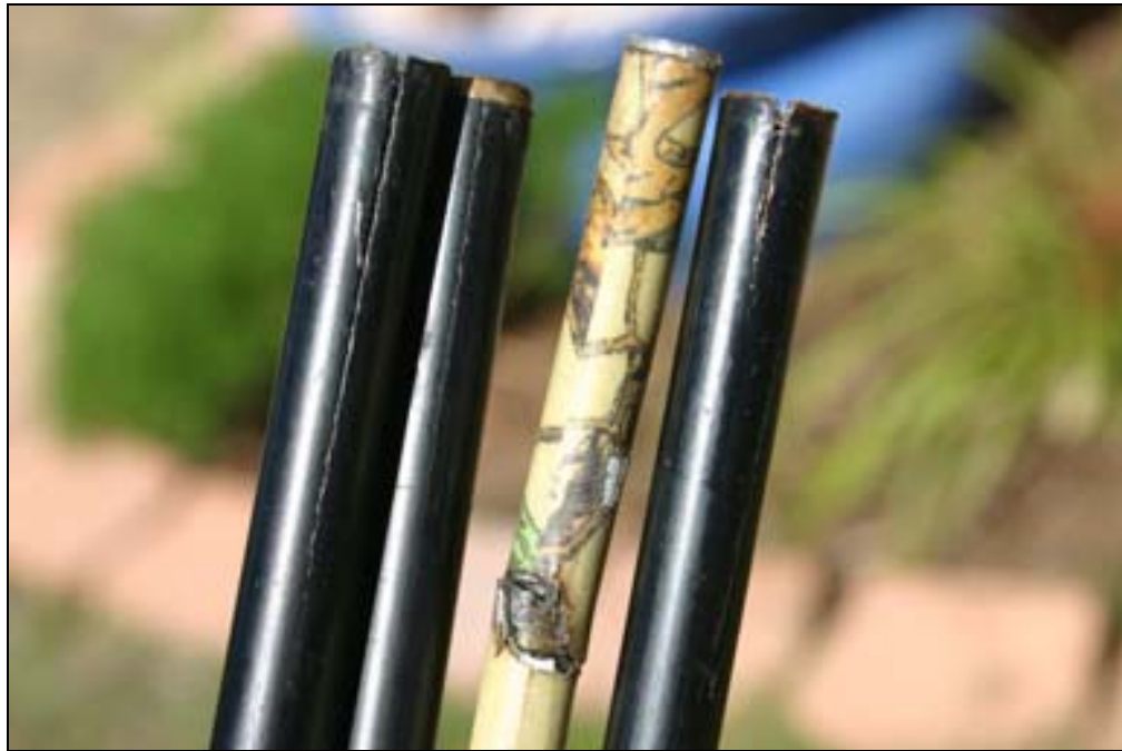
Carbon shafts often break or split at weak point of broadhead to shaft juncture when broadhead, broadhead taper or insert becomes damaged.