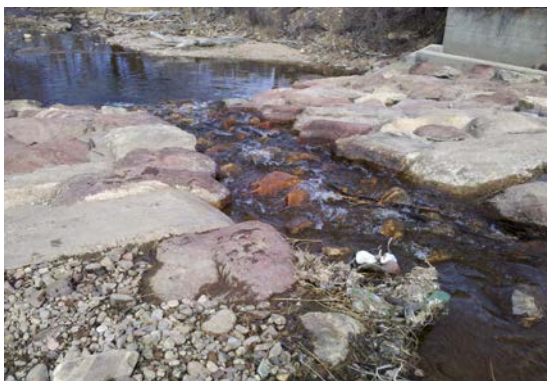
TRADITIONAL DIVERSION WITH ROCK RAMP