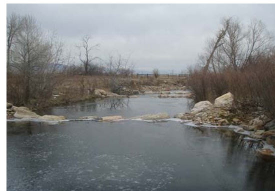
BOULDER CROSS-VANE DIVERSION