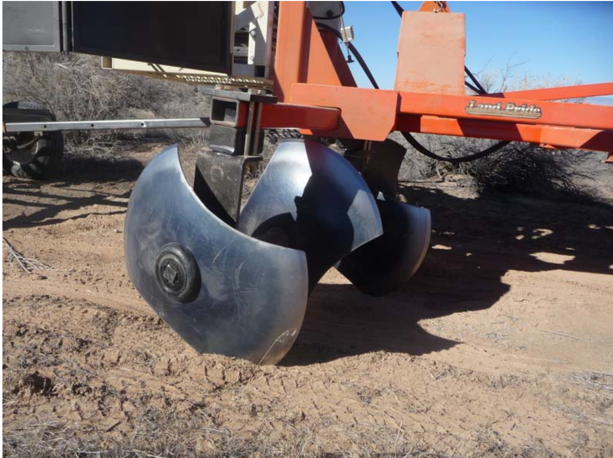
Figure 3. Disks were deeply notched on the pothole seeder, and the notches were offset on adjacent disks.