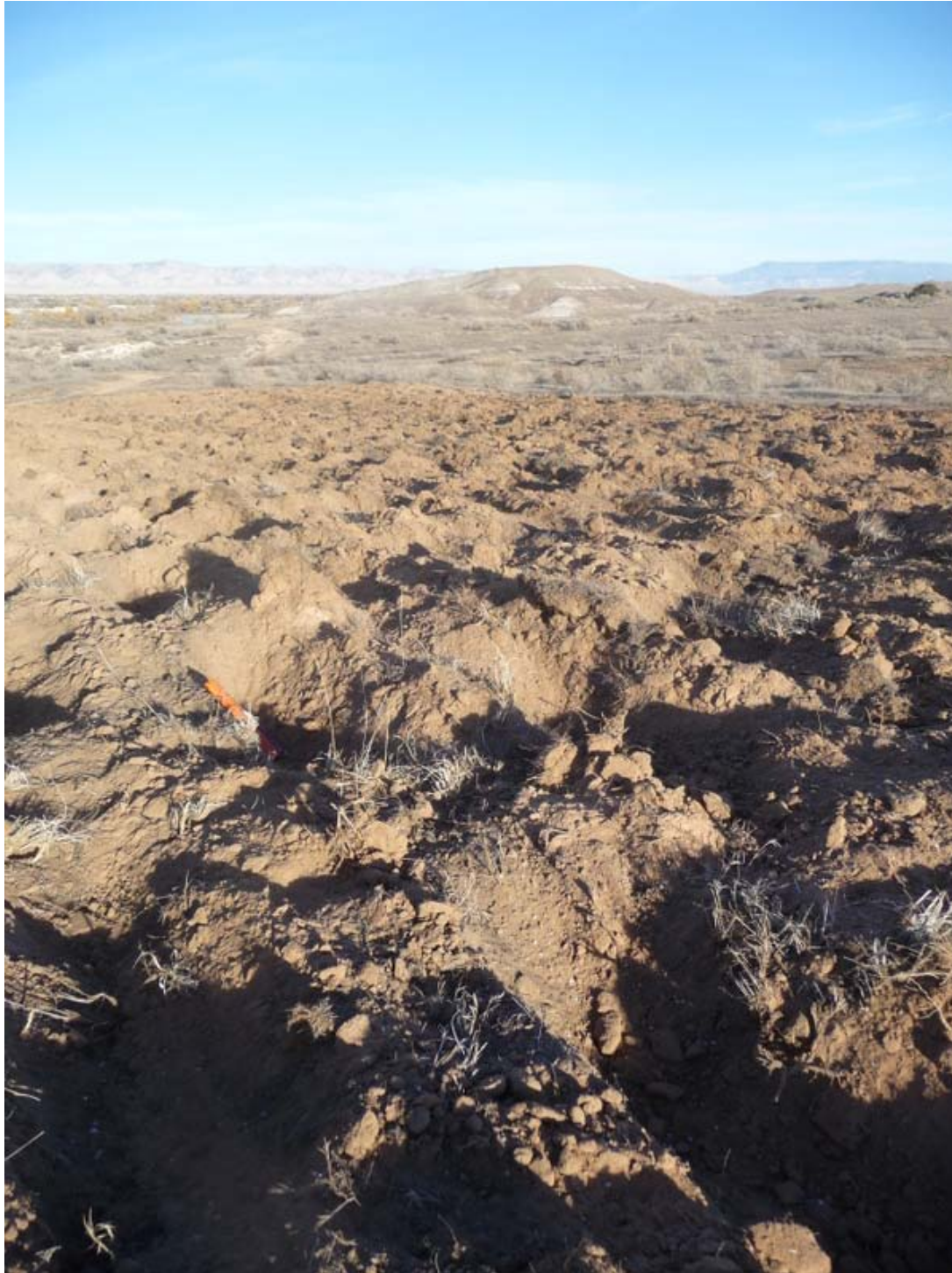
Figure 4. Alternating pattern of mounds and holes created by the pothole seeder. Orange notebook provided for scale.