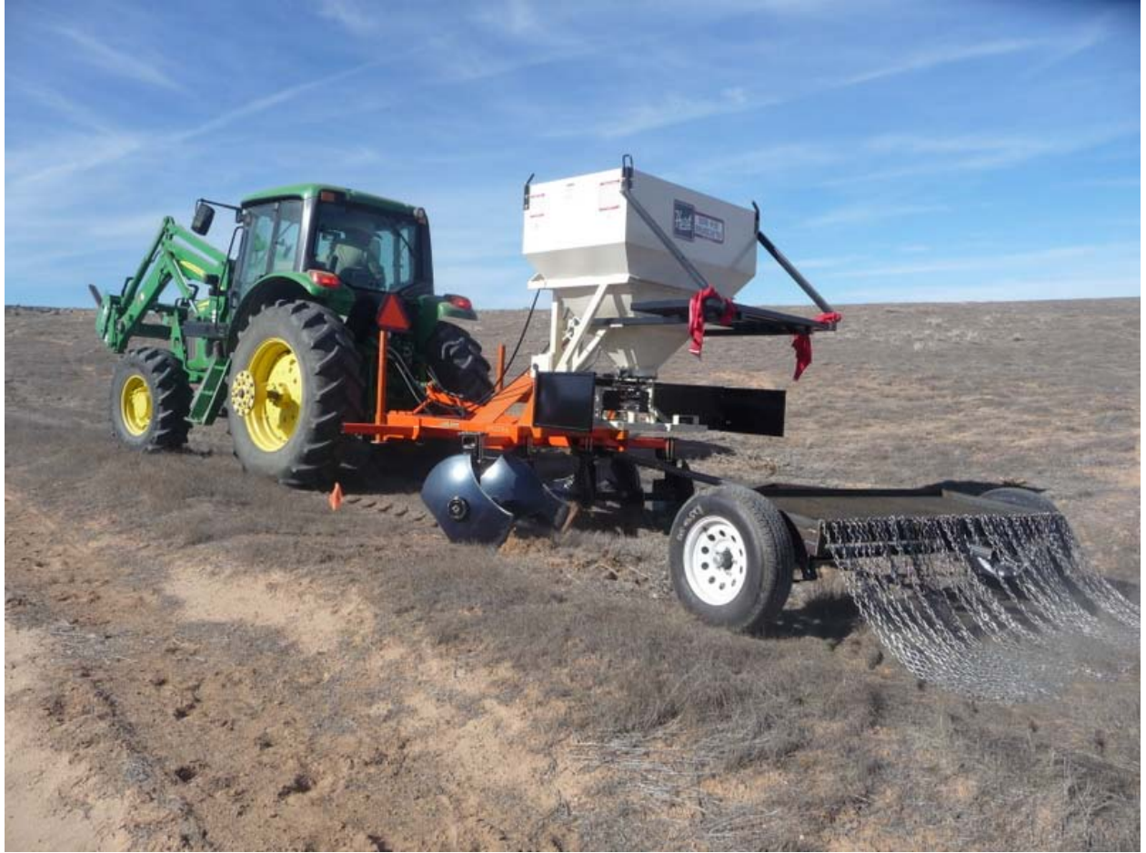
Figure 2. The pothole seeder.