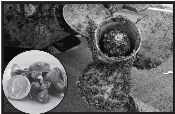
Inset photo-CA Dept. of Fish and Game

For additional information please contact: