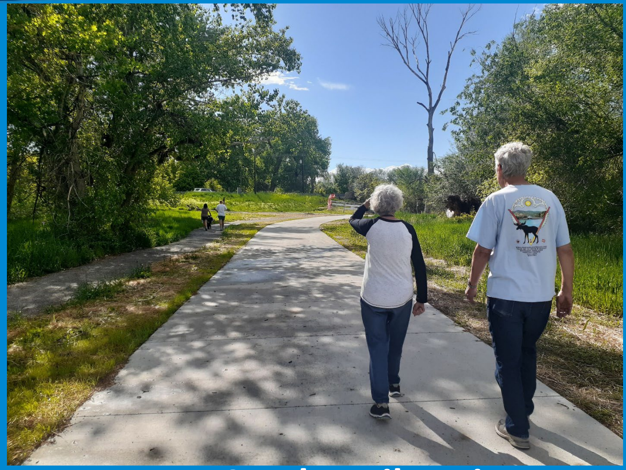
Bear Creek Trail Project

State Recreation Trails Committee Presentation