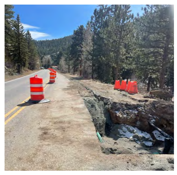
A previously funded CPW (Colorado the Beautiful) grant helped to fund the Phase 4 construction of the Fall River Trail.