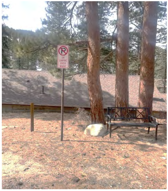
During the busy tourist season, cars will use this area as a place to park. The construction of the Fall River Trail in this area will take away the shoulder area and make it more difficult for cars to park illegally.