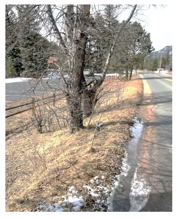
Horizontal space will be added to the existing shoulder offering enhanced safety.