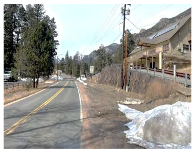
The Estes Park United Methodist Church has a hiking group that uses the portions of the already constructed Fall River Trail.