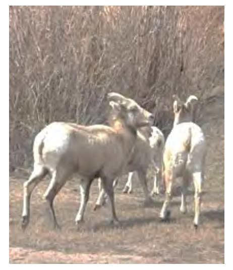
Throughout the length of the trail (including the final segment pictured here), there are opportunities to view wildlife.