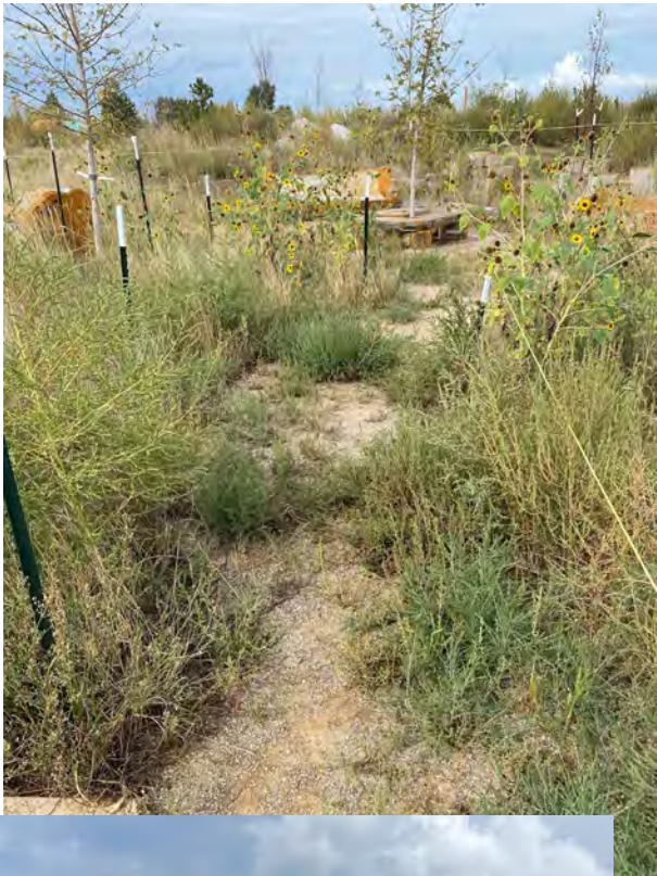
RIGHT: Vegetation management in the nature play sections of Campo Esperanza is essential to provide a safe, welcoming area for kids and families. This is a high priority area for the trail stewardship crew since it is the only natural in the entire east Greeley community.