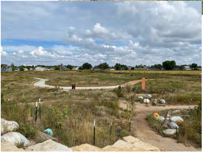
RIGHT: A view of Campo Esperanza from the top of the nature play hill. The boulders are intended for nature play and require intensive vegetation management via string trimming.