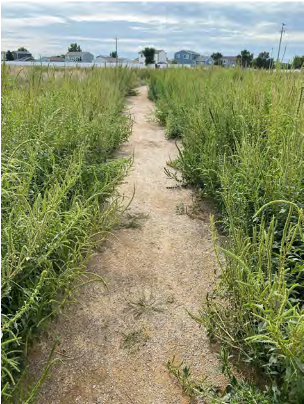
LEFT: NAT field crews struggled to keep up with trailside mowing in the 2023 season, resulting in overgrown trails and proliferation of non-native weeds.