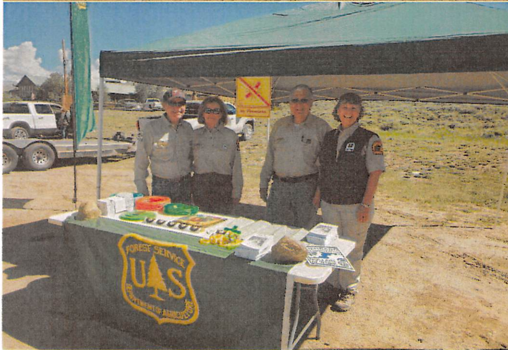
“Stay the Trail” Education Day, Taylor Park, July 4 th 2022