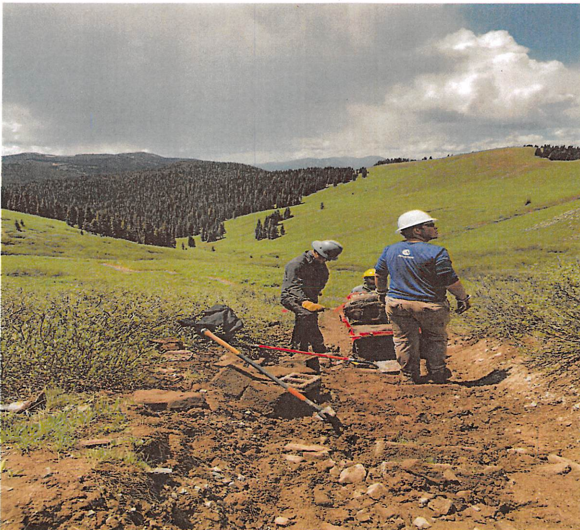
Gunnison Trail Crew working with Western Colorado Conservation Corp. (WCCC) on Double Top Trail #405