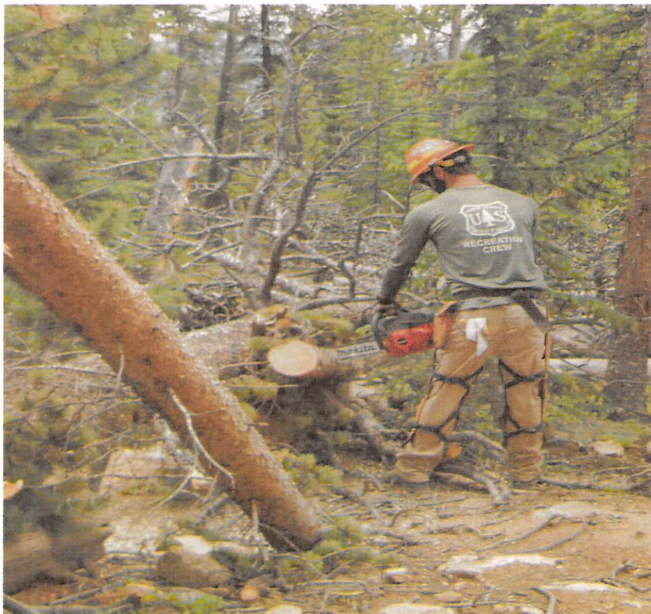
Clearing Double Top Trail #405