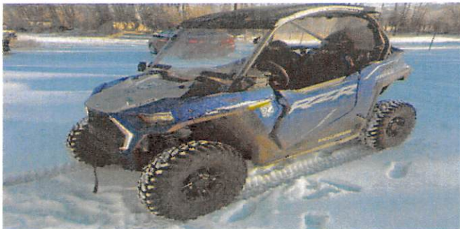
New UTV with "Dollars at Work Sticker