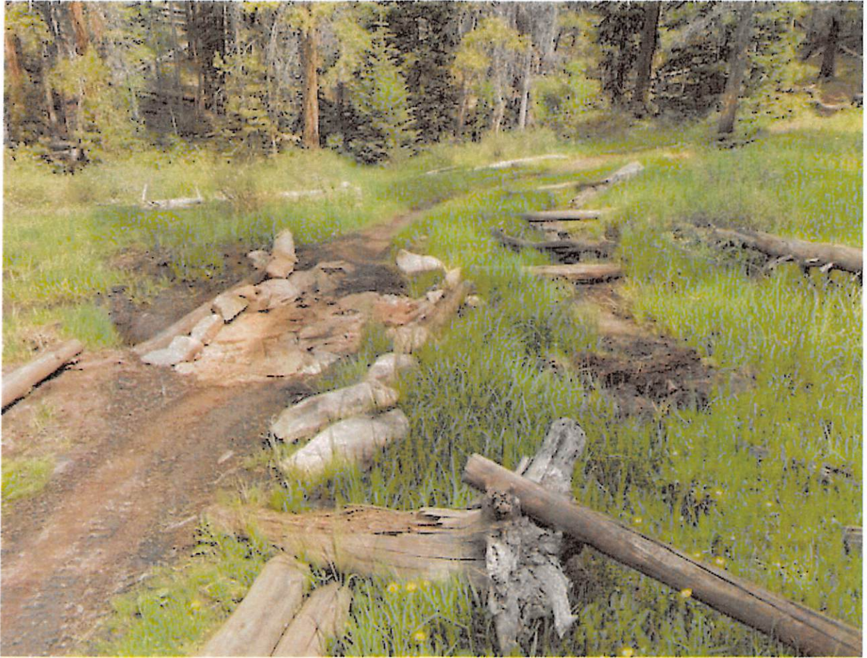
Quakey Mountain Trail #537 Rock Armor and Trail Braid Restoration