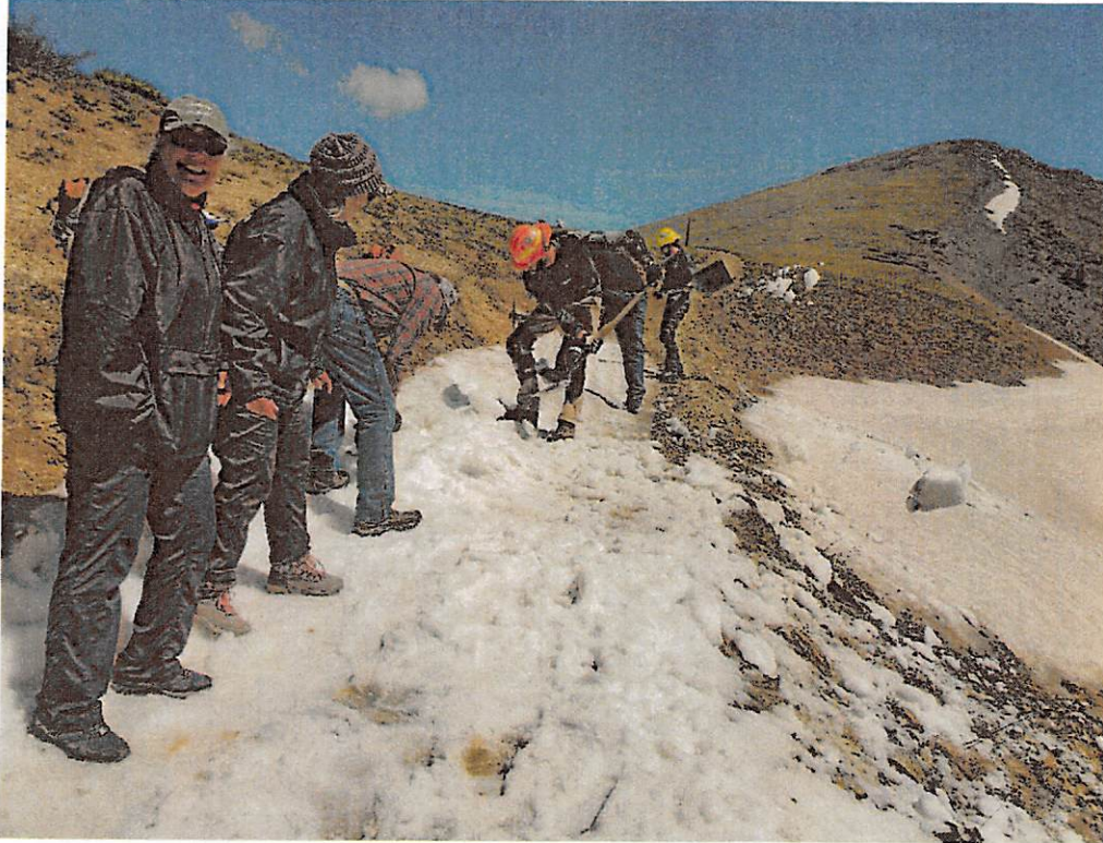
Gunnison Trail Crew Clearing Timberline Trail for Users, June 2022