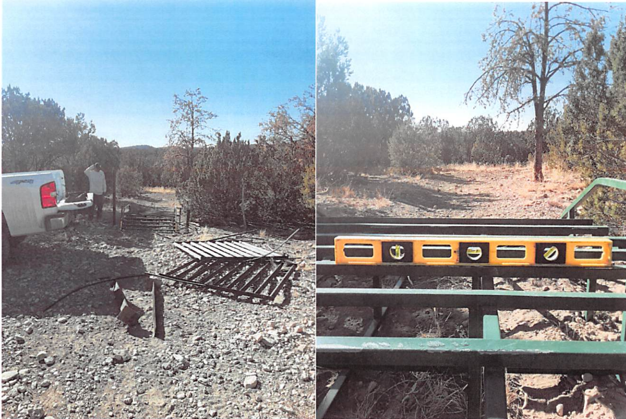
Image 1: Installation of new cattle guard at Penrose Commons, per expectation of FY22 crew duties.