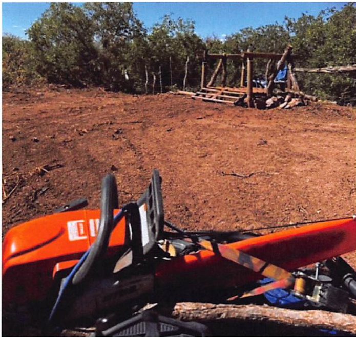
Work Done by Subcontractor