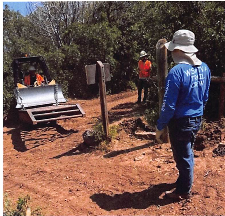
In Progress WSATVA Work Crew