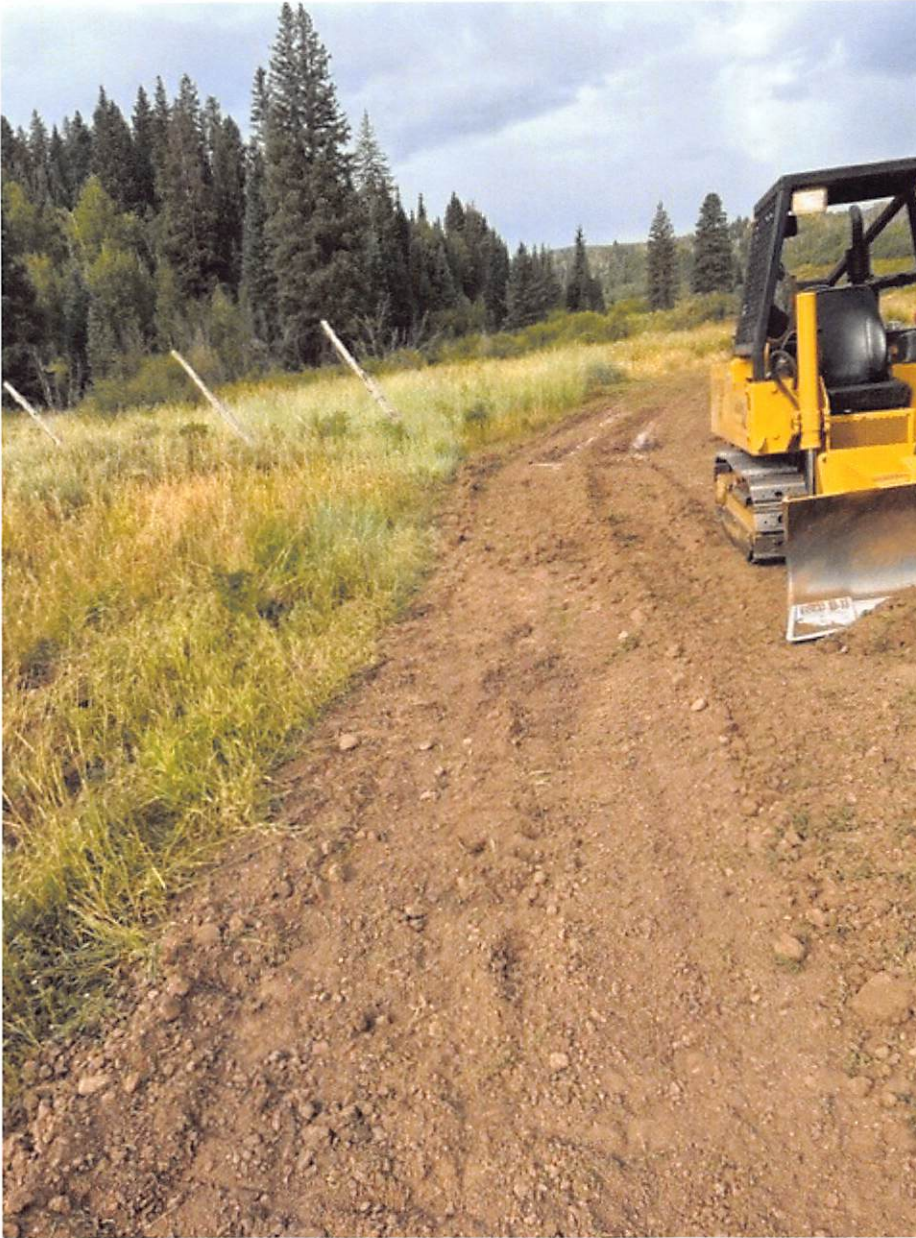
Dozer working on Road 266