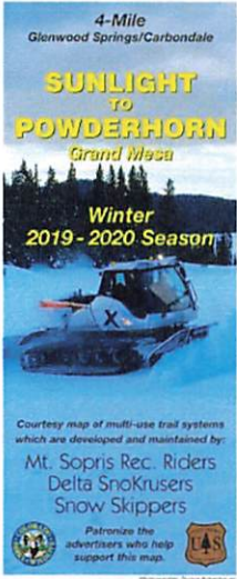
EXHIBIT E TRAIL MAP Attach Trail Map Separately