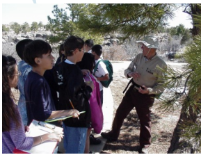
School group enjoying a day on the trail.

Why? We want to ensure that your visit is enjoyable and educational. Priority is given to groups that have reservations. If you arrive without reservations, there may not be enough facilities to accommodate everyone. The visitor center or slide show may not be available. With crowding on the trails, teachers have to compete with other groups for their student's attention. Reservations also allow us to minimize human impacts on our natural resources. If the park has reached capacity, your group may be denied entry.