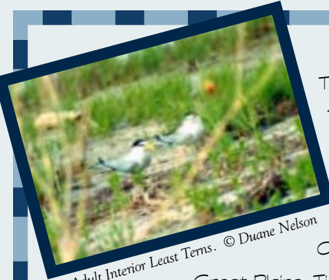
Adult Interior Least Terns.

The Interior Least Tern and the Piping Plover share the shorelines of John Martin, Adobe Creek (Blue Lake),