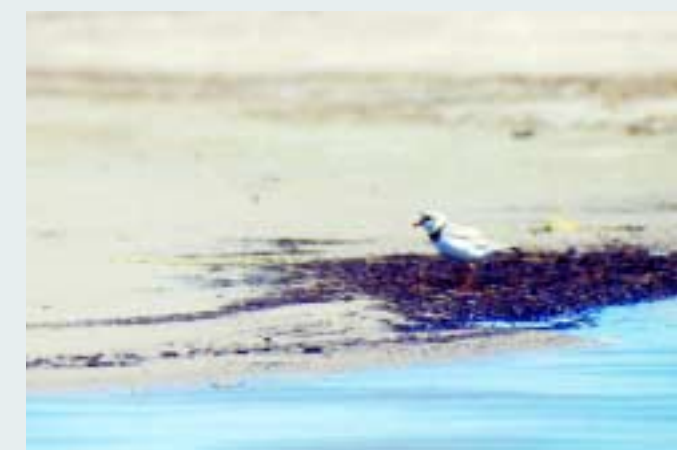
An adult Piping Plover on the shoreline.

With continued public education and research, as well as habitat protection and restoration, progress is being made towards securing a future for these birds, but much remains to be done. Please help us conserve these endangered species by avoiding active nesting areas and not disturbing the birds.