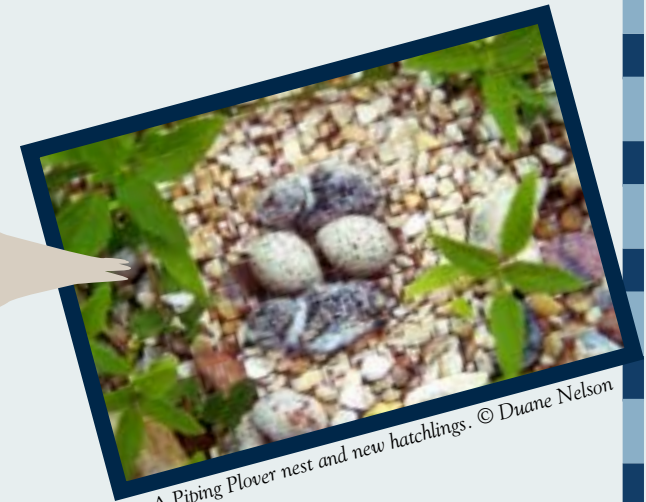
A Piping Plover nest and new hatchlings.