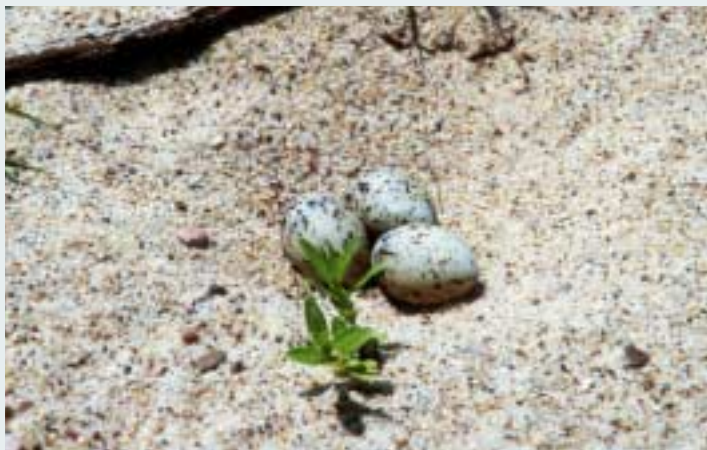
An Interior Least Tern nest.

These closures are posted with signs and/or simple fencing, alerting people on shore to the presence of active bird nesting sites. Buoys with signs warn boaters and swimmers to the presence of nesting sites.