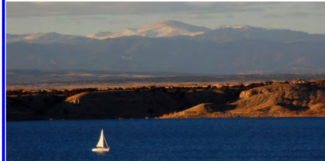
Beautiful day for Sailing and Breath taking view of Pikes Peak.

Visit all of your Colorado State Parks and Wildlife Areas!