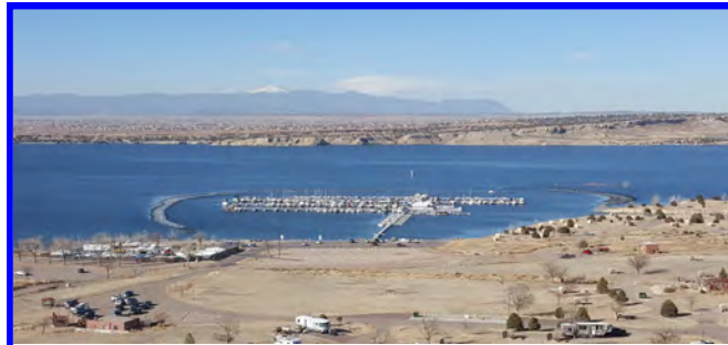
Beautiful view of Arkansas Point Campground and South Marina