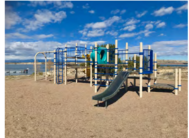
Playground with a short walking distance from Quail Run Pavilion

Website: http://cpw.state.co.us/placestogo/parks/boydlake/Pages/GroupPicnicArea.aspx