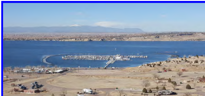
Beautiful view of Arkansas Point Campground and South Marina