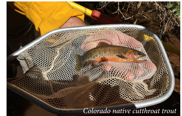
Colorado native cutthroat trout