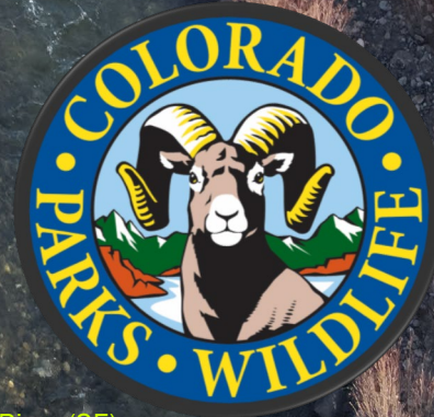
Mt. Shavano Low Head Dam Removal Project-Arkansas River (SE)