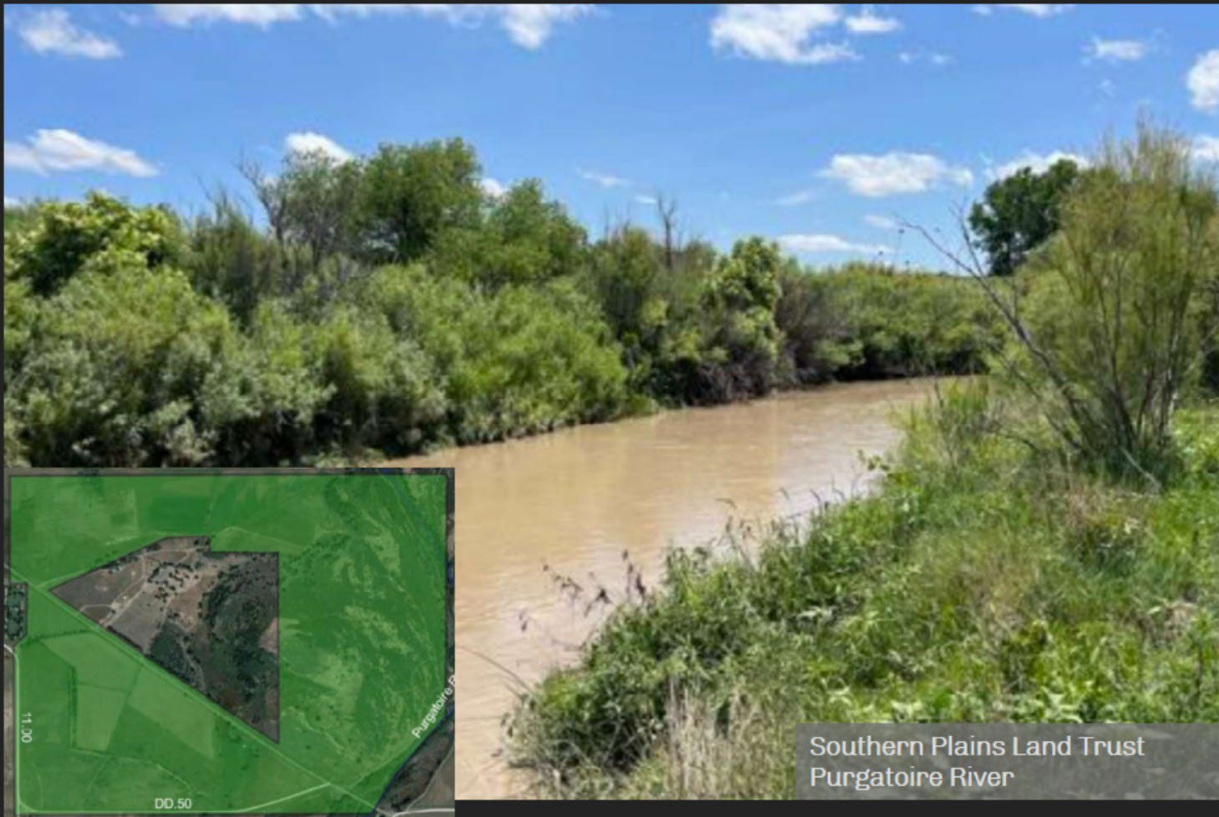
Southern Plains Land Trust Purgatoire River