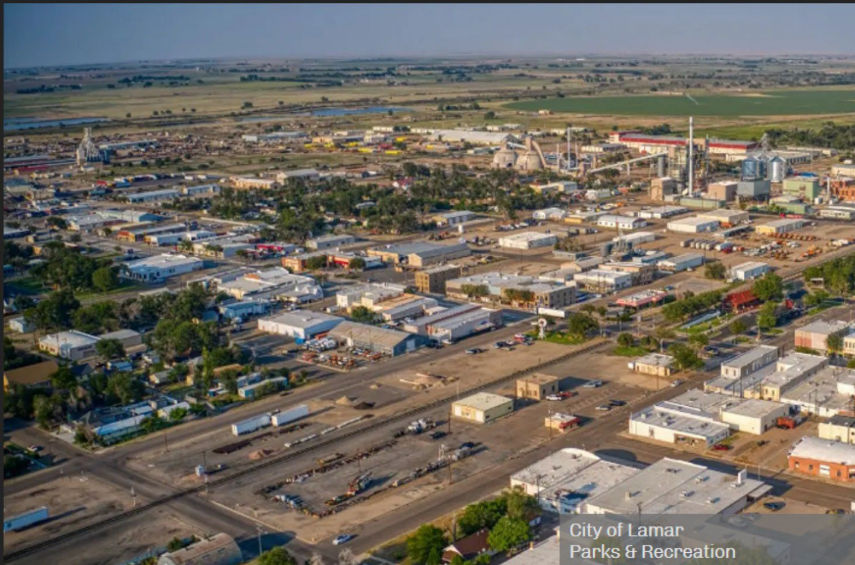
City of Lamar Parks & Recreation