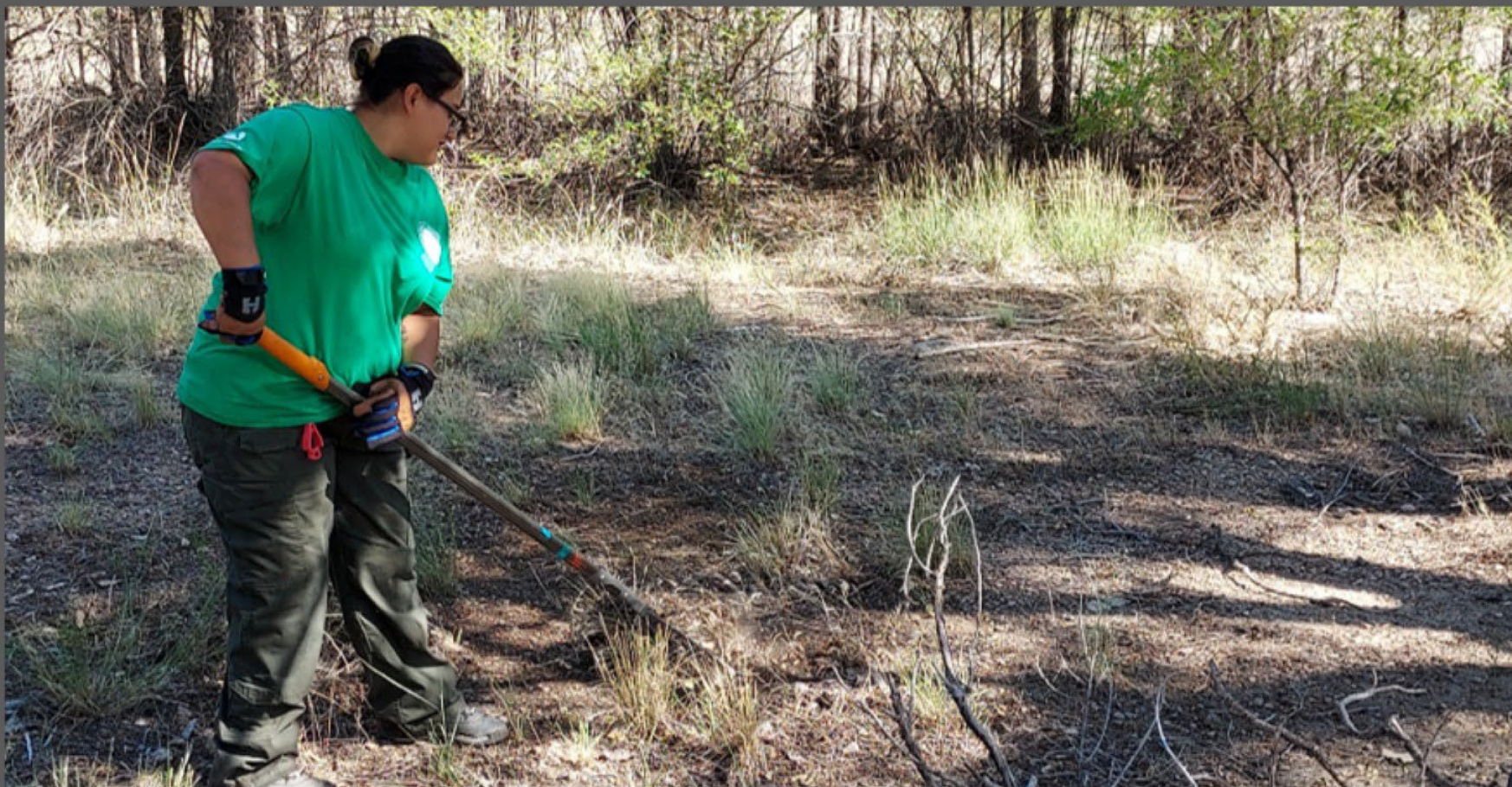
MHYC Eastern Plains Pilot Corps at Crystal Lake Recreation Area – City of Rocky Ford