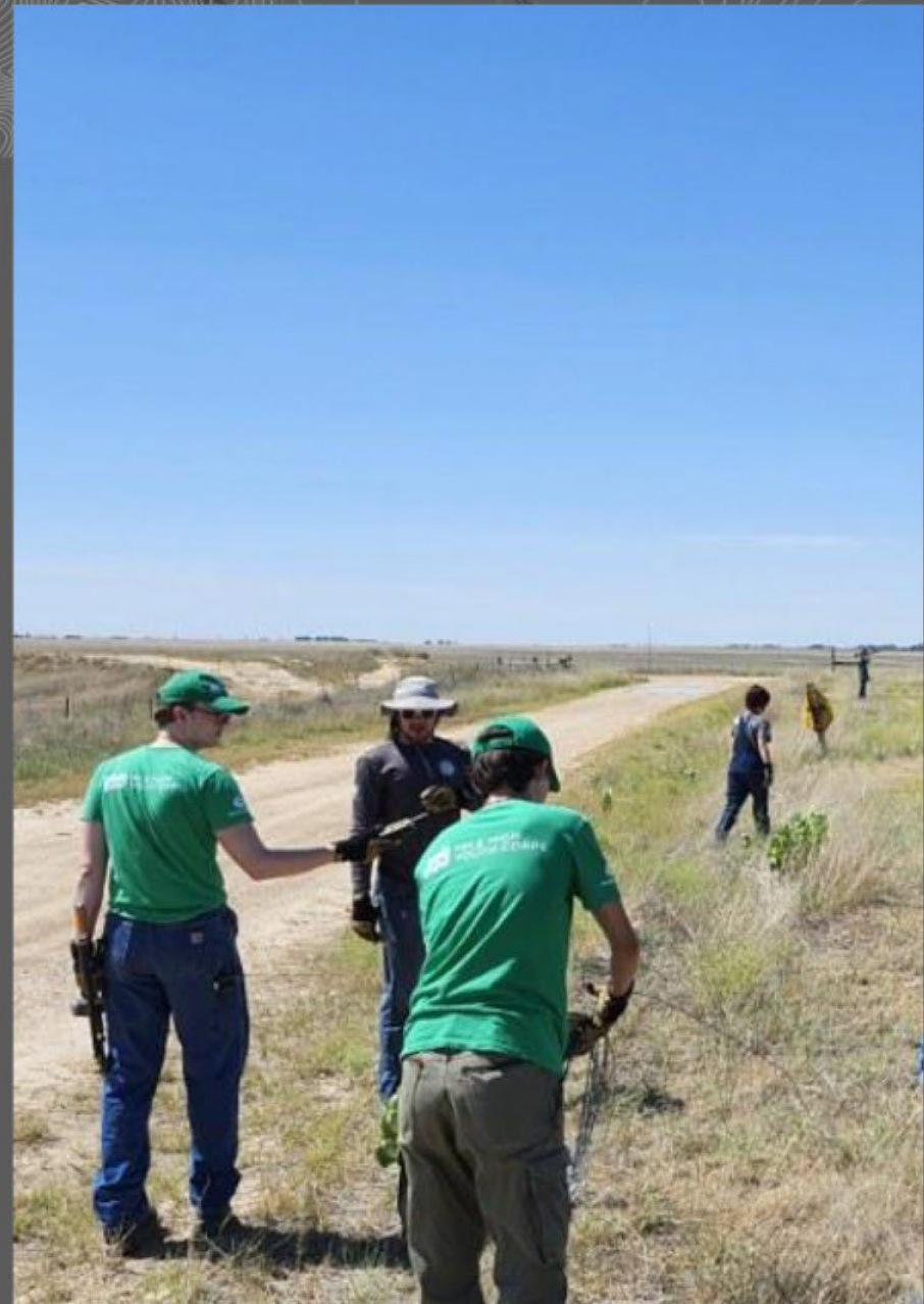
Queens State Wildlife Area