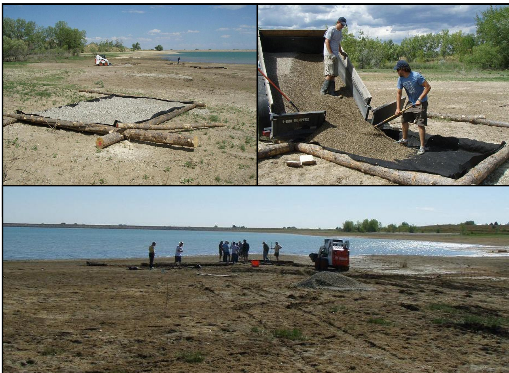
Above: Installation of spawning habitat during reservoir drawdown specifically designed to attract both largemouth bass, crappie, and bluegill. Survey results indicate the number of young bass and panfish have increased compared with years prior to the habitat project.

Rainbow Trout: The most recent angler survey found that rainbow trout were the most sought after species at Lon Hagler. With such a large proportion of anglers targeting trout and the high return, trout stocking will continue. Anglers should keep in mind, that the "catchable" trout feed aggressively a few days after stocking and are often deep hooked. If you deep hook a trout chances are extremely unlikely such a fish will survive; a perfect opportunity to fine tune your culinary techniques. As of April 2020, more than 13,000 catchable trout have been stocked into Lon Hagler this year.