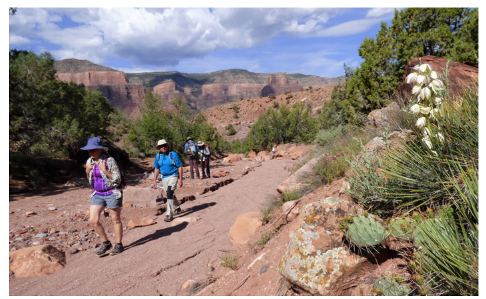
Volunteer stewards at Gateway Palisade Natural Area, Mesa County