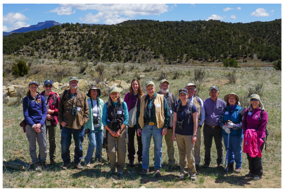
CNAP volunteer field tour of Trinidad K-T Boundary Natural Area, Las Animas County, in April 2019

Volunteers contributed well over 1,300 hours in 2019 to the program, visiting 40 natural areas. Together staff and volunteers made sightings of 58 plants or wildlife species of greatest conservation need, as listed in the Colorado State Wildlife Action Plan. Over 100 occurrences of rare features were revisited by staff and volunteers, with the feature relocated over 90% of the time, and fifty updated or new records of tracked features were submitted to the Colorado Natural Heritage Program for inclusion into the statewide database of tracked elements. The Natural Areas Program values our dedicated volunteers, just over half of which have been with the program over 10 years. We look forward to another great season coming up in 2020!