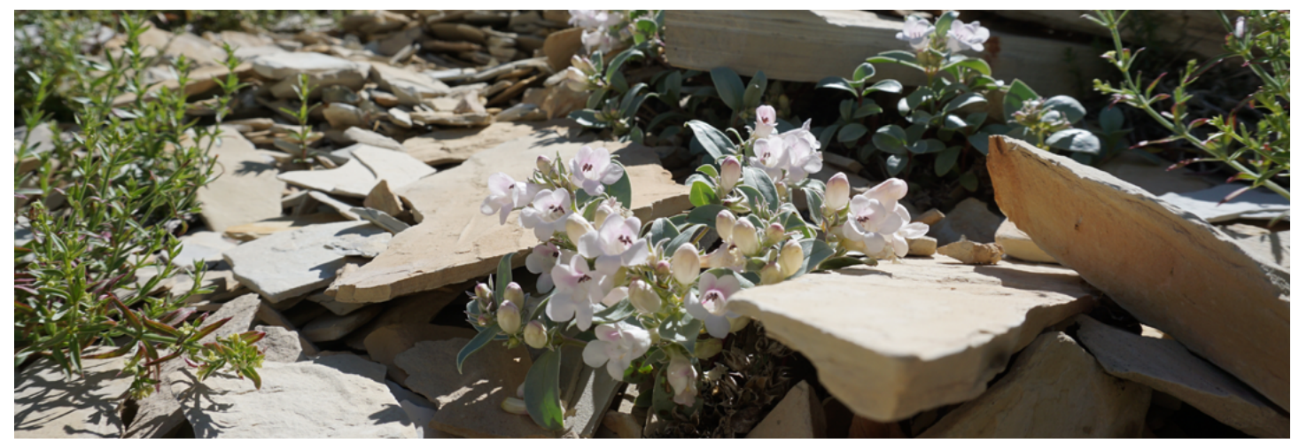
Parachute penstemon (Penstemon debilis), federally threatened plant species, at Mount Callahan and Logan Wash Mine Natural Area