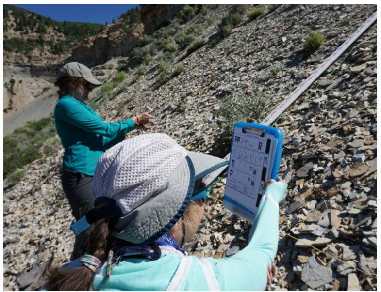
CNHP staff monitoring for Parachute penstemon at Logan Wash Mine Natural Area, Garfield County

Innovations continued in 2019 with a test of a new monitoring and survey tool: drones. CNHP, joined by U.S. Fish & Wildlife Service staff, flew ten flights in eight hours along the slopes of Mount Callahan, to test the detectability of Parachute penstemon with three different types of drones and cameras. Survey and monitoring at Mount Callahan is more difficult than Logan Wash, with plants growing on steep slopes accessed from the top of the mountain and a 2,500 foot drop below. Methods piloted in 2019 will be used in an expanded project in 2020, funded by the National Fish & Wildlife Foundation, with CNHP partnering with private consultants Aridlands, LLC and EcoloGIS to expand surveys to other inaccessible slopes across potential habitat within the species range.