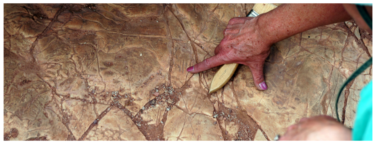
Trace fossil evidence at Indian Spring Trace Fossil Natural Area