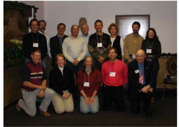
Members of the Colorado Wolf Management Working Group at their December 14-15, 2004 meeting in Golden, CO

FROM THE COLORADO WOLF MANAGEMENT WORKING GROUP