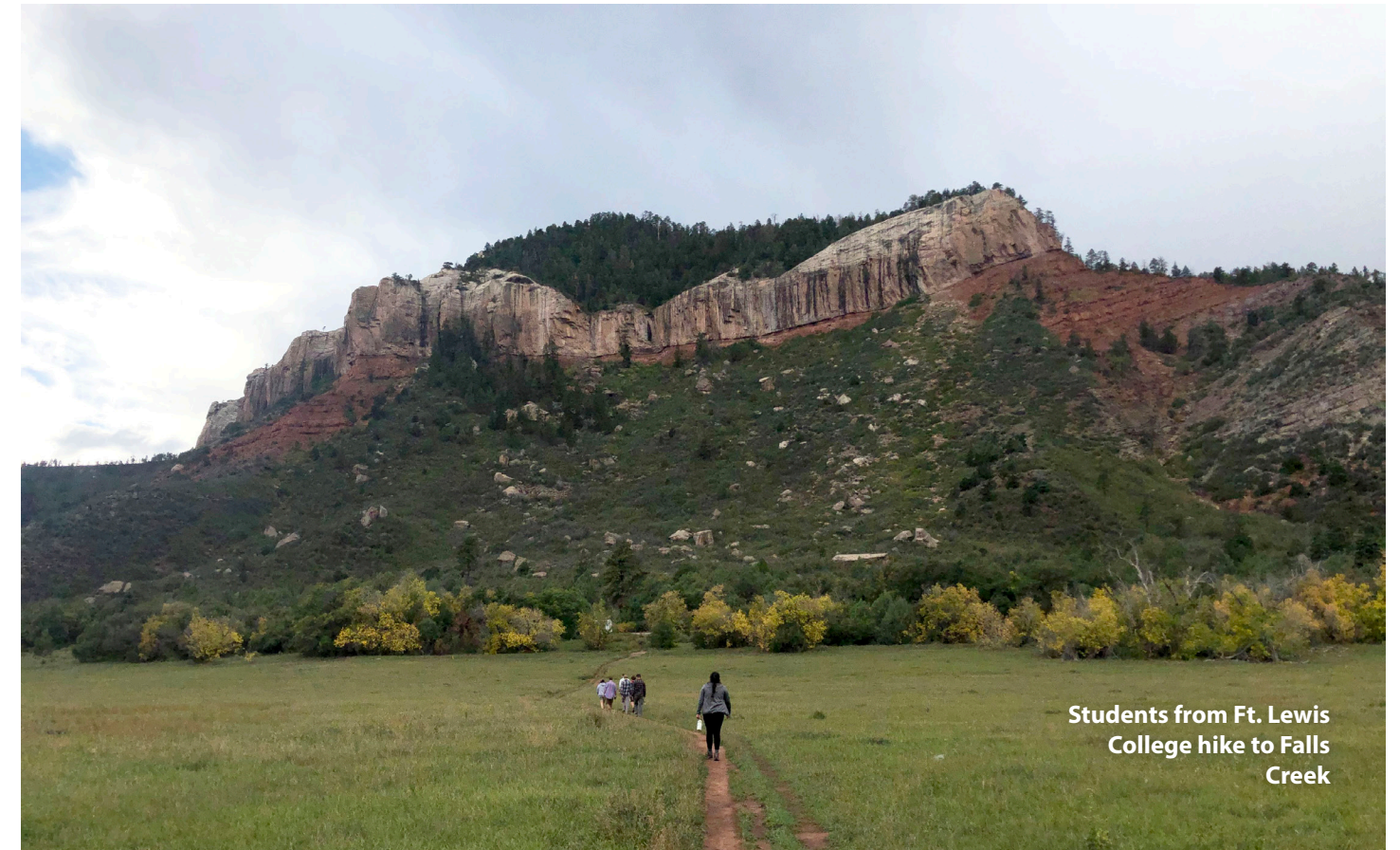
Students from Ft. Lewis College hike to Falls Creek