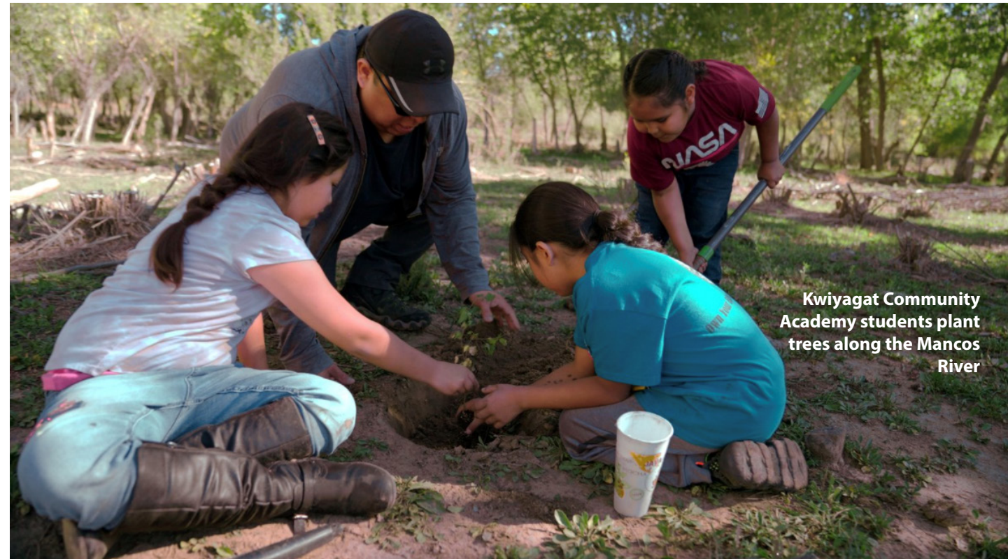
Kwiyagat Community Academy students plant trees along the Mancos River