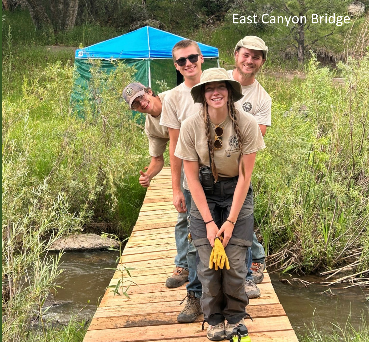
East Canyon Bridge