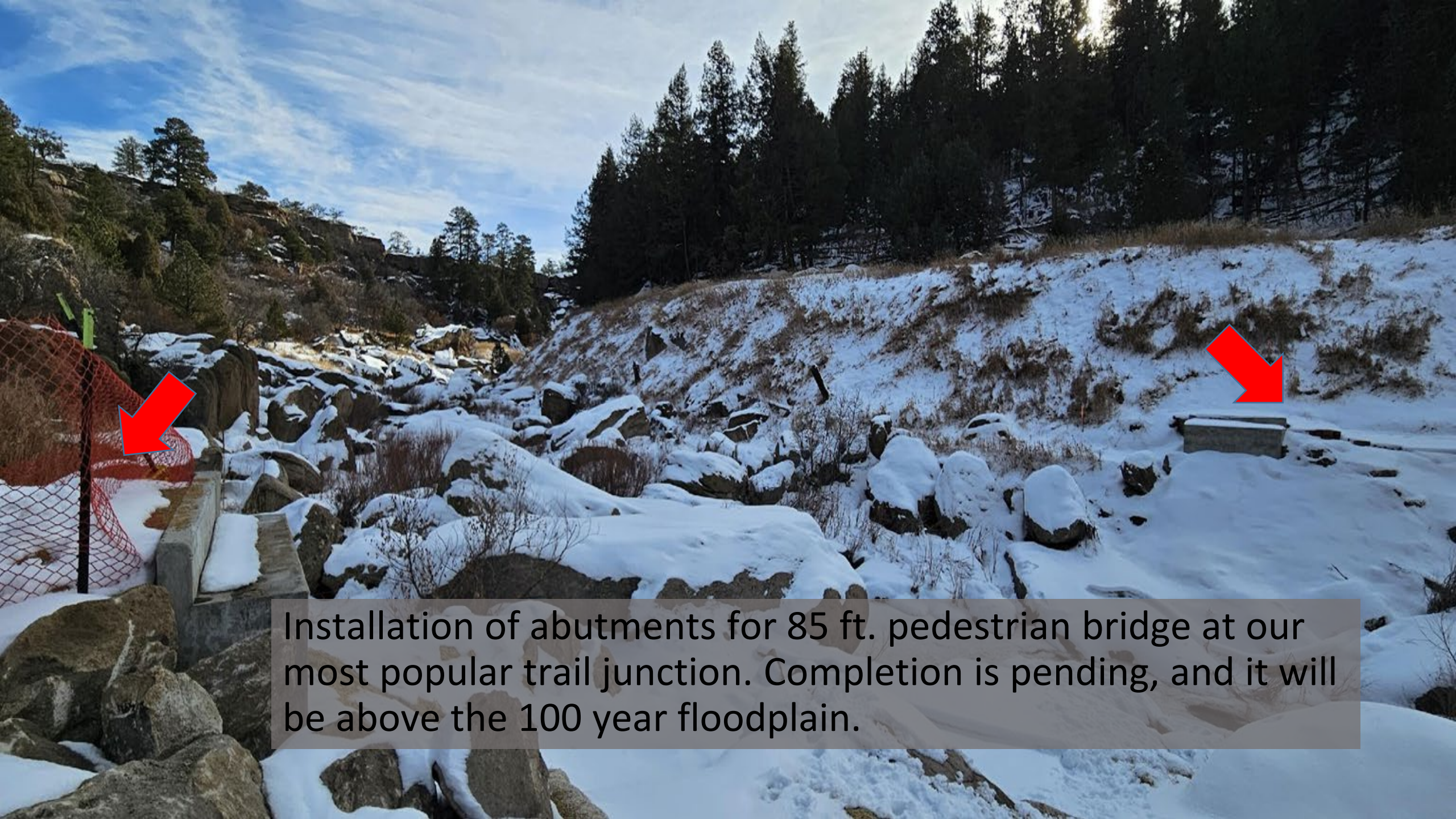
Installation of abutments for 85 ft. pedestrian bridge at our most popular trail junction. Completion is pending, and it will be above the 100 year floodplain.