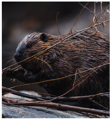
beaver