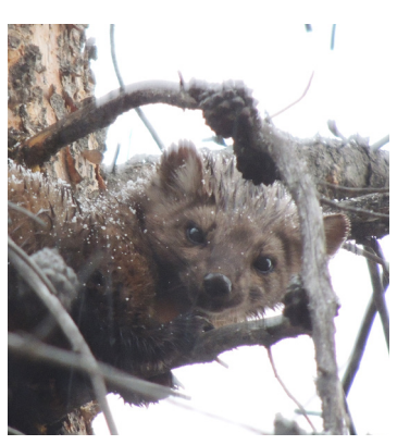
pine marten