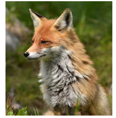
fox © ebaso