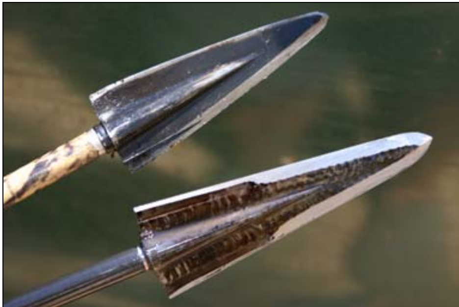
The 258 grain Pro Big Game (Lower) dwarfs even the 190 grain Grizzly (Upper).