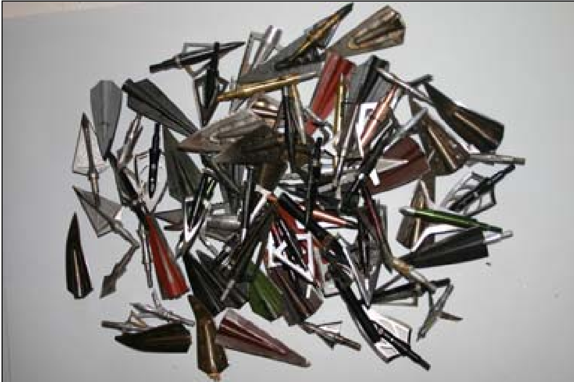
Some of the broadheads damaged during 2005 testing.