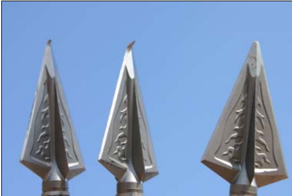
Factory tips on Shkote 170 grain broadheads routinely bent on rib-impact shots. Note heavily rolled edge visible in left image.