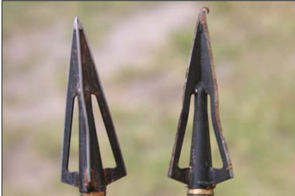
These Wensel Woodsman broadheads were damaged on right-angle rib impact, halting their penetration. Note differing tip design; factory tip (R) curled on every shot while modified tip (L) remained undamaged on all shots.