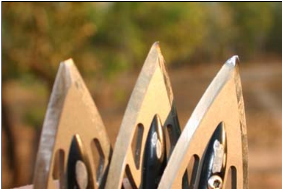
SilverFlame tips suffered damage only during adverse angle bone impact, an easily corrected detail. Thus far, it is the only screw-mount, or alloy ferruled, broadhead to make the "best broadhead's" list.