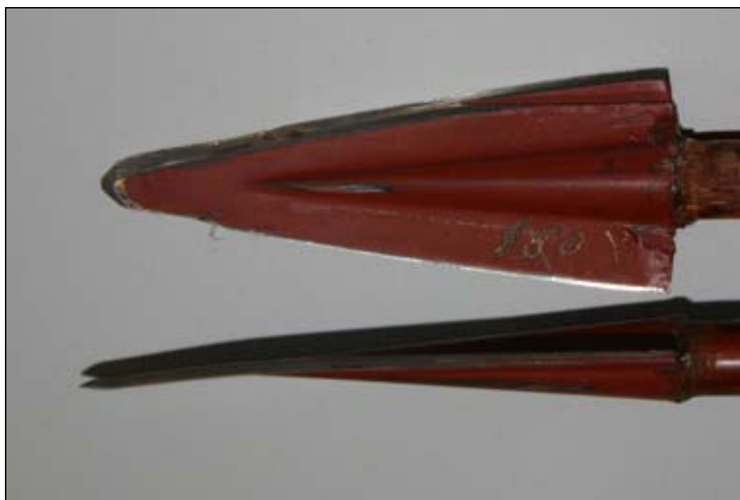
The two bent 160 grain Grizzly broadheads

*** Approximately 50% modified to COI Tanto tip.