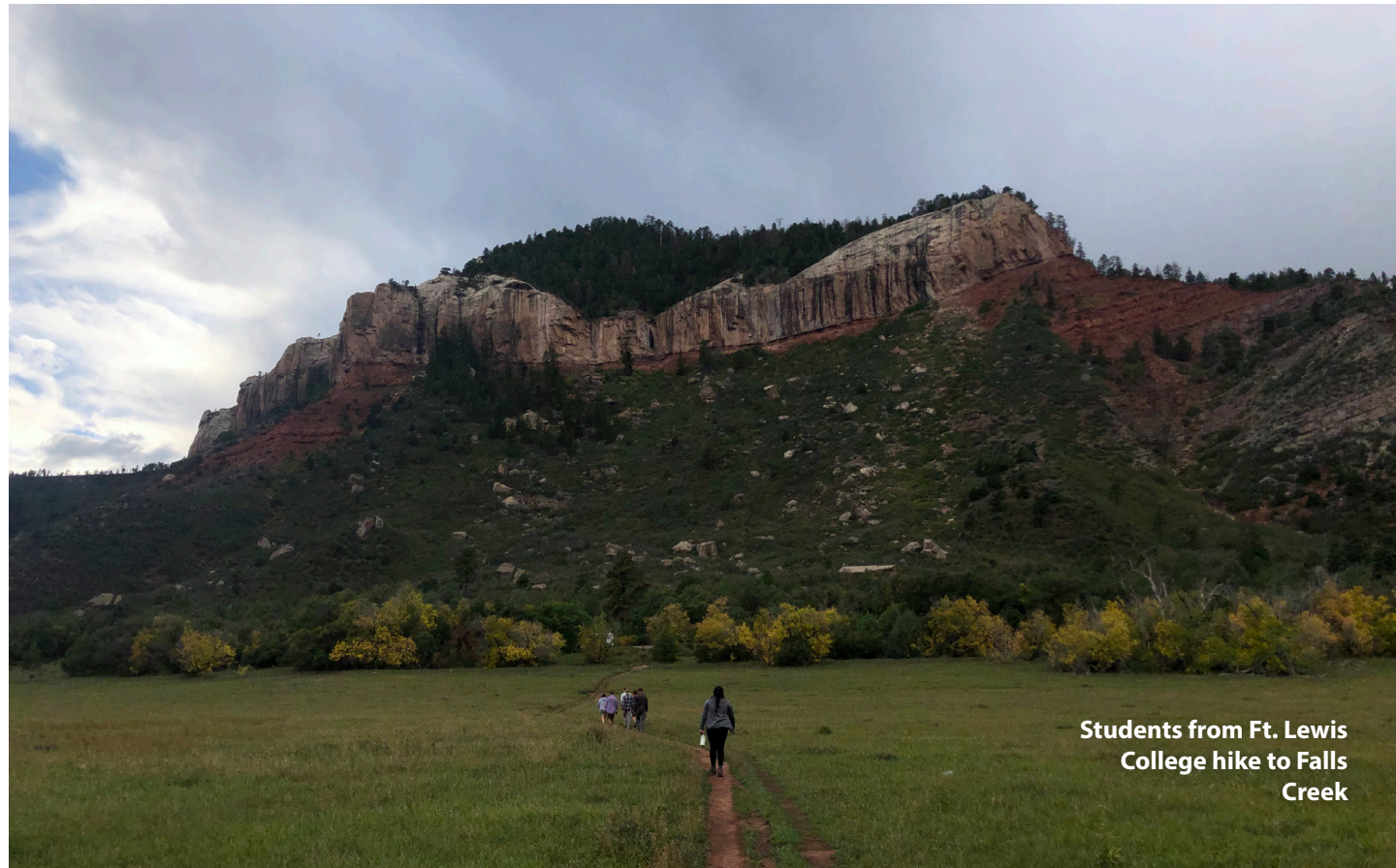
Students from Ft. Lewis College hike to Falls Creek