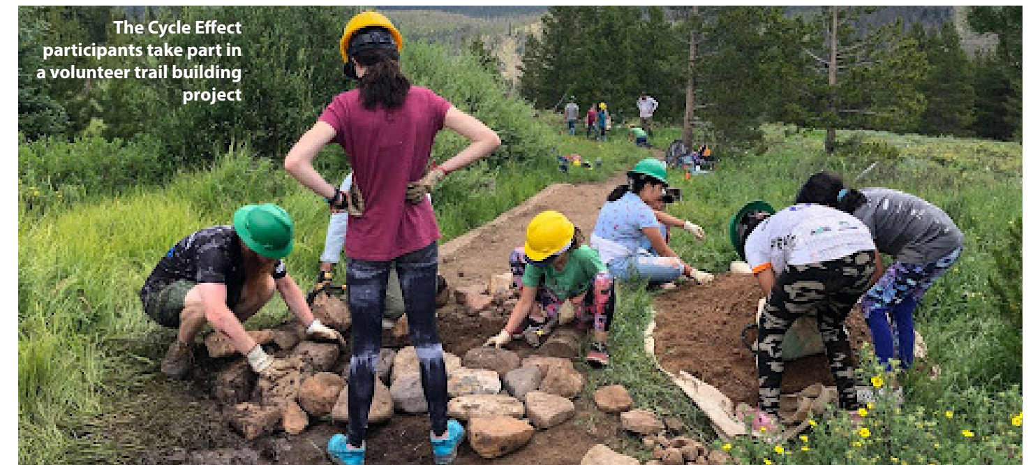
The Cycle Effect participants take part in a volunteer trail building project