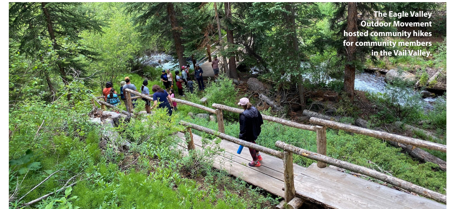
The Eagle Valley Outdoor Movement hosted community hikes for community members in the Vail Valley.

Grant funds reached participants who are residents of the following counties: Adams, Alamosa, Arapahoe, Boulder, Broomfield, Chaffee, Conejos, Costilla, Denver, Douglas, Eagle, Elbert, El Paso, Fremont, Garfield, Gilpin, Grant, Gunnison, Jefferson, Lake, La Plata, Larimer, Las Animas, Mesa, Mineral, Montezuma, Morgan, Park, Pitkin, Pueblo, Rio Grande, Routt, Summit, Weld.