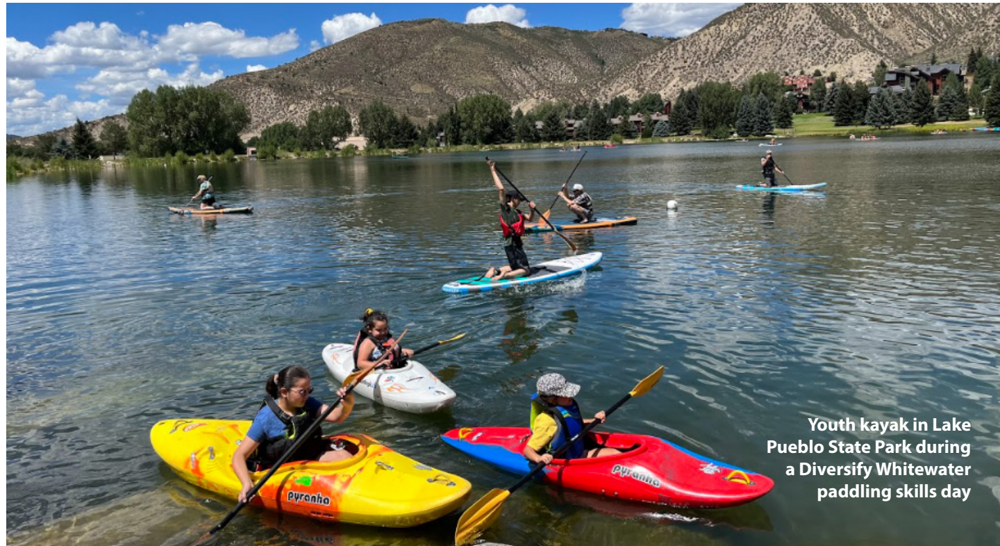
Youth kayak in Lake Pueblo State Park during a Diversify Whitewater paddling skills day