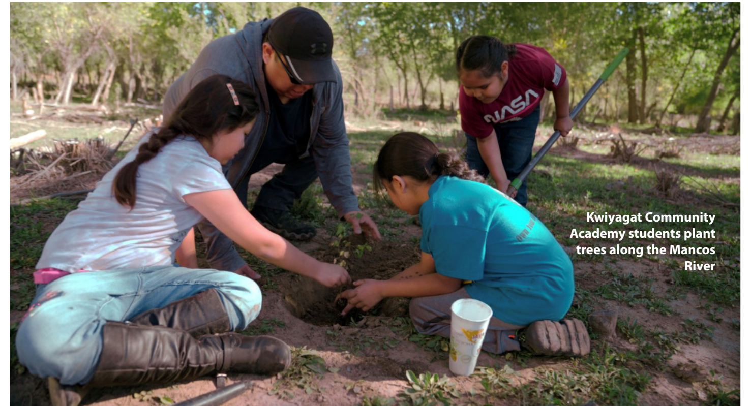
Kwiyagat Community Academy students plant trees along the Mancos River