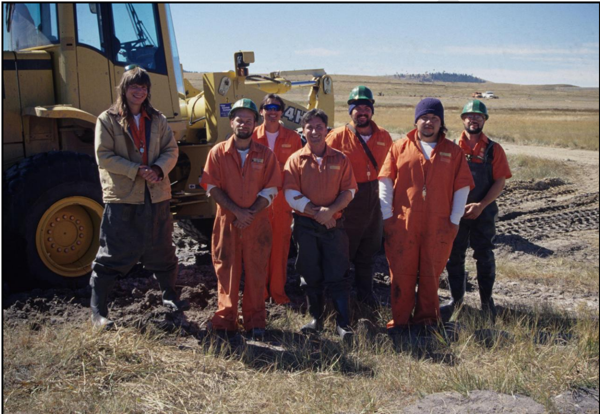
Figure 1. Photo of VHCT inmates involved in the first restoration project in South Park, 1998.

The first CDOW/CDOC river restoration project was completed in 1998 (Figure 1). The CDOW paid for restoration materials including boulders, trees, and cobble; heavy equipment rentals; inmate salaries (at $.60 per hour) and provided on-the-job technical assistance. This first river restoration project using student inmates was highly successful in terms of enhancing aquatic habitat for sport fish and restoring natural river processes. More importantly when these inmates (about 20 students) were released from prison, they all found jobs in the construction industry and were successful in turning their lives around.