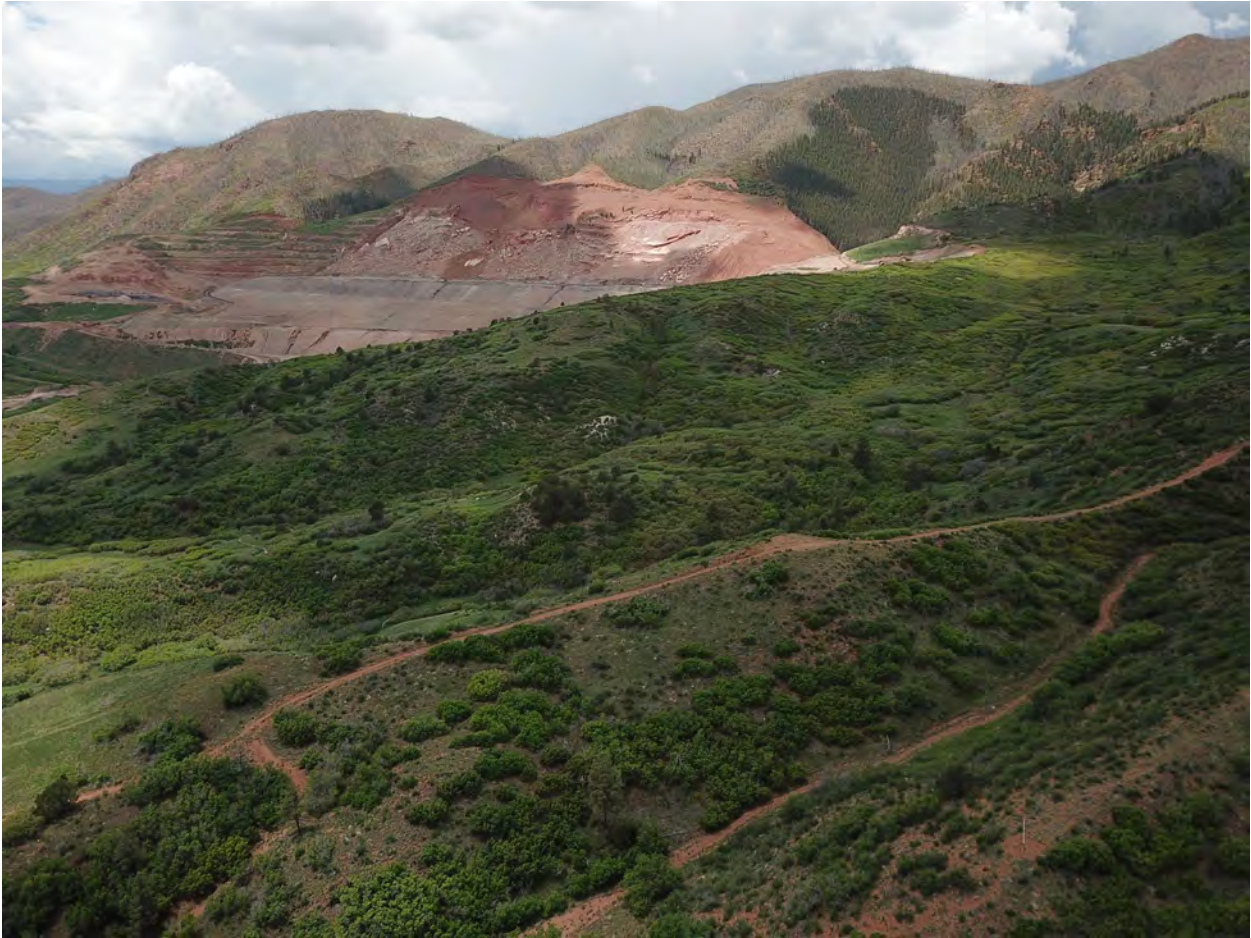
Aerial View of South Blodgett Open Space (looking west)

Some existing trail routes and access roads are depicted. Quarry reclamation area is in the upper center/left. Newly acquired parcels are in the upper foreground.