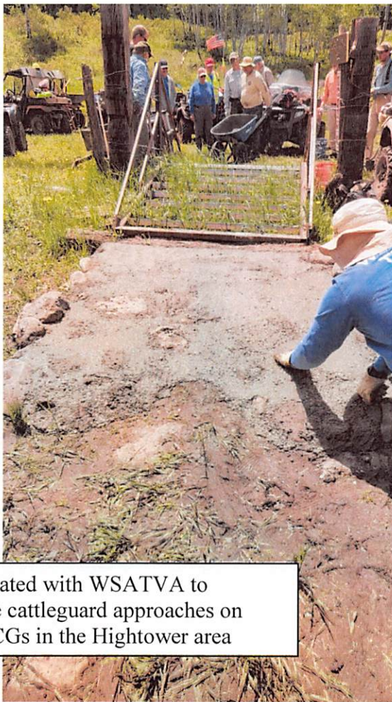
Collaborated with WSATVA to reinforce cattleguard approaches on several CGs in the Hightower area