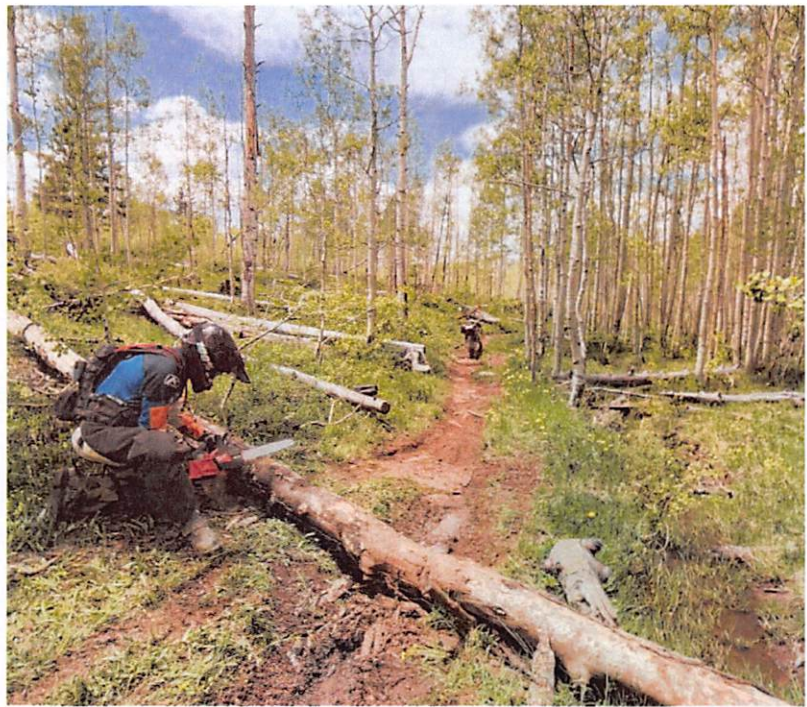
Collaborated with MTRA on early season clearing/trail assessment on Ute Creek in June