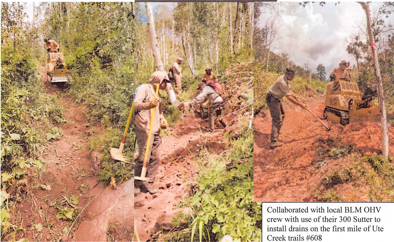
Collaborated with local BLM OHV crew with use of their 300 Sutter to install drains on the first mile of Ute Creek trails #608