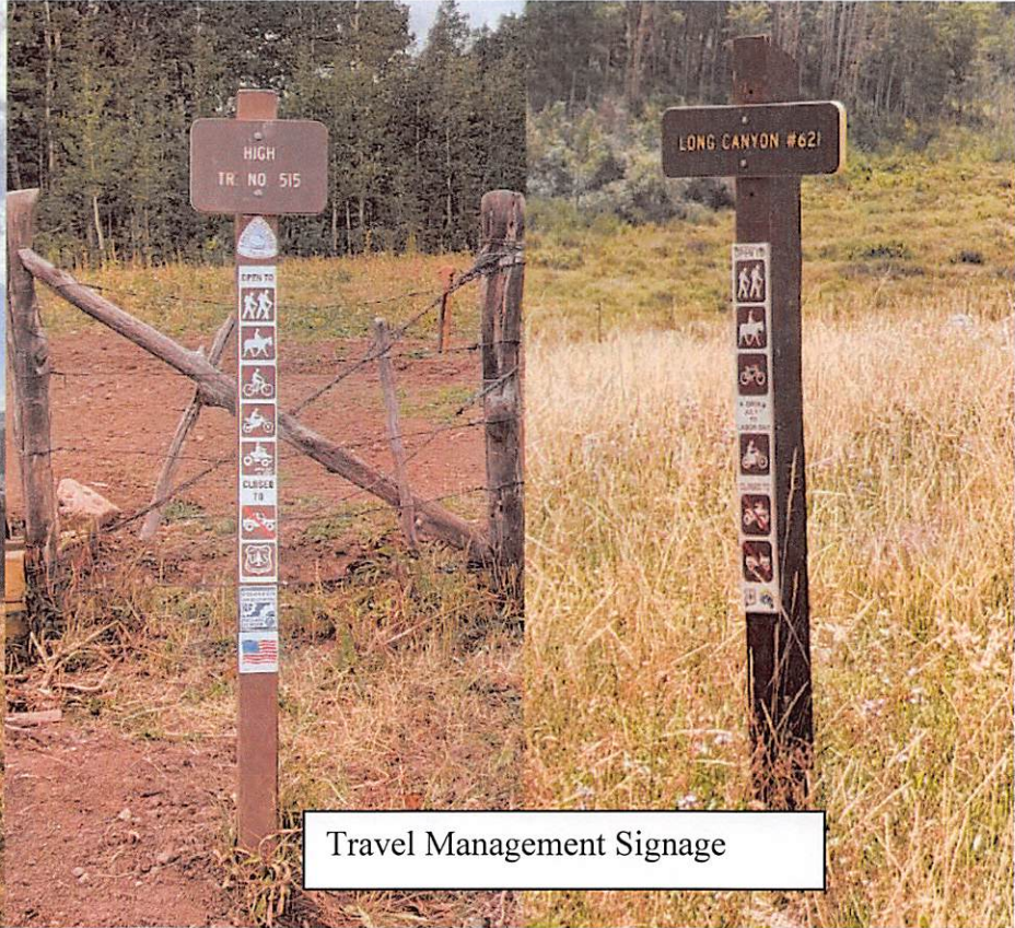
Travel Management Signage