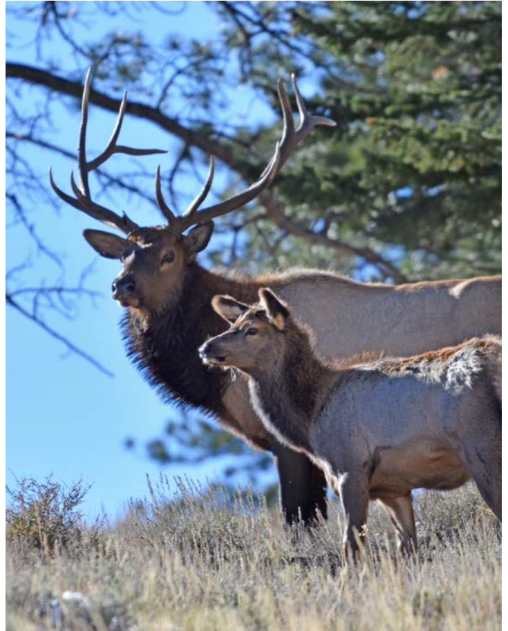
© WAYNE D. LEWIS / CPW