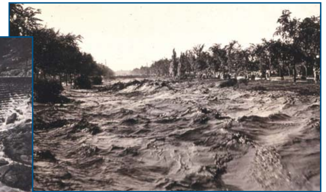
Looking down Speer Boulevard

The wall of water grew higher as it approached Denver and reached the city about 7:00 a.m. It traveled down the concrete canal that follows Speer Boulevard. Reports vary about the depth of the water, but aerial photos show that much of the lowlands along Cherry Creek and the South Platte River were submerged. Damage was extensive, but only two people died.