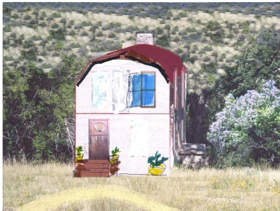
Sketch by Bob Metzler, grandson of Patrick and Margaret Lucas

The Lucas Homestead is located on the west side of Castlewood Canyon State Park. To visit it, turn south on Castlewood Canyon Road which is 1/2-mile west of the intersection of Highways 83 and 86 in Franktown. Travel 2.1 miles to the Homestead Parking Lot on the east side of the road. The lot is 1/10-mile past the park entrance station.