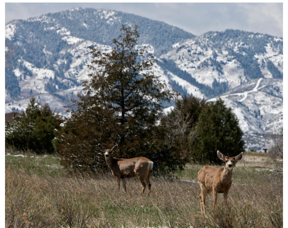
KEN PAPALEO/HIGH COUNTRY COLORING