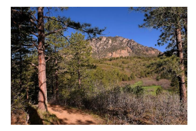
MEDIUM LOOP – 2.5 miles – Moderate ( Highlighted on map in blue )

For a gentle experience, try the Short Loop utilizing the Turkey Trot trail. With excellent views of Cheyenne Mountain and Colorado Springs, and frequent deer and turkey sightings, the Short Loop is a great way to get to know the Terrain Hopper without committing to a several hour long sojourn.