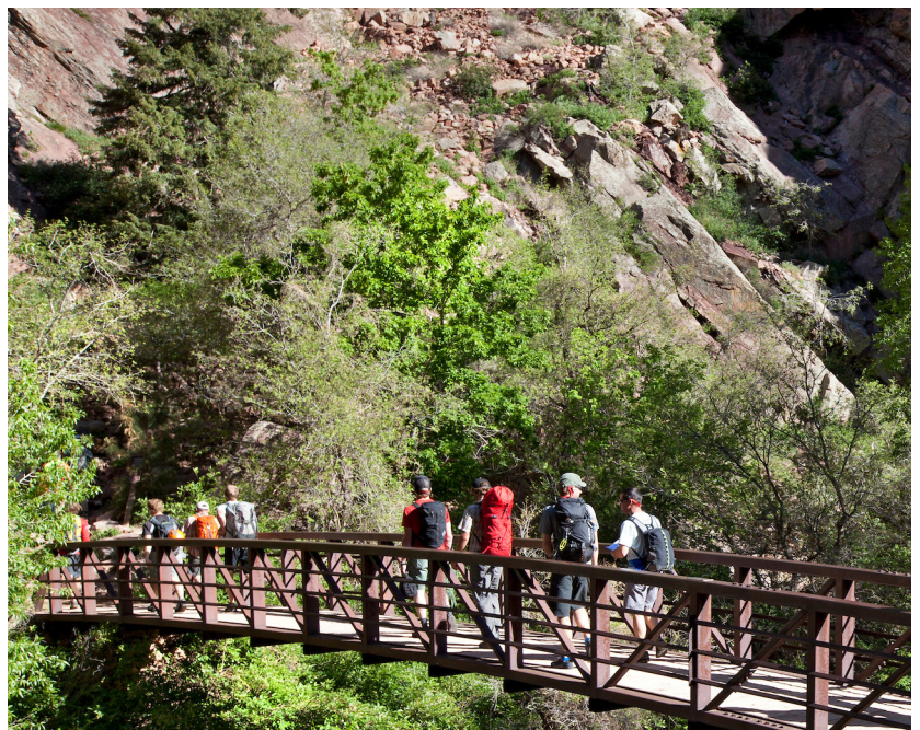
KEN PAPALEO/HIGH COUNTRY COLORING/CPW