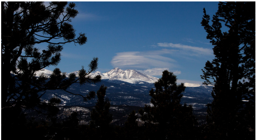
KEN PALEO/HIGH COUNTRY COLORING